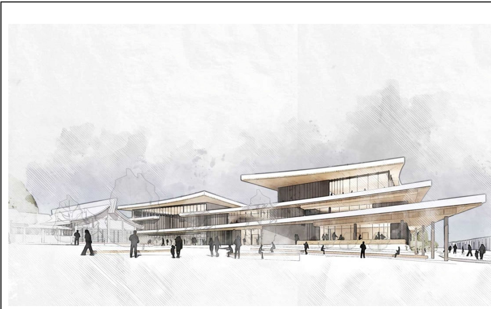
Figure 1. Steveston Community Centre and Library Rendering