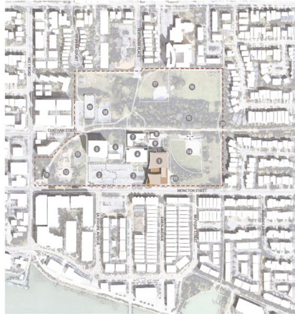
Figure 3. Steveston Community Centre and Library site plan