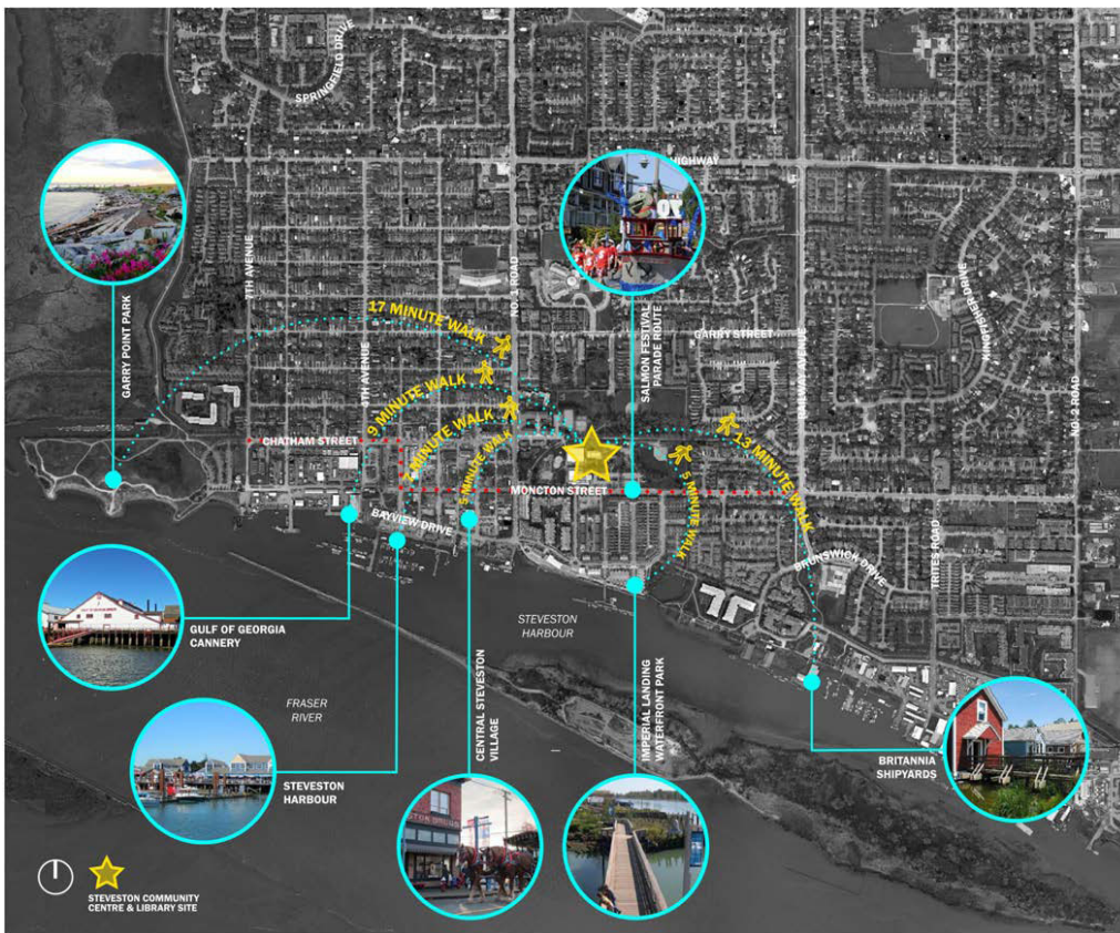
Figure 2. Steveston Context

Steveston has many significant human history and natural attractions that give the community a distinct sense of place, and the Steveston Community Centre and Library site is at the geographic centre of it all. The Gulf of Georgia Cannery, Garry Point Park, Imperial Landing Waterfront Park, and other major community amenities are within a short walking distance of Steveston Park. (Figure 2)