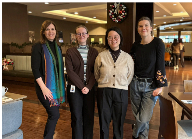
Friends of the Richmond Archives Interns.