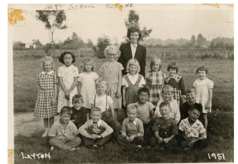
Robert Monsen school photographs: Hamilton Elementary School, 1951.