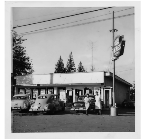
Kings Foods Market, 479 Blundell Road, ca. 1960-1965.