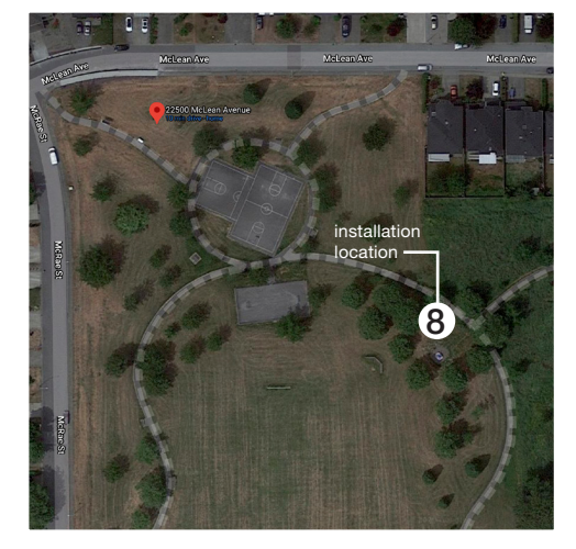
Location 8: McLean Neighbourhood Park 22500 McLean Avenue - in tree grove near the "Blue Heron" public art installation

Picture Yourself Here... Grad 2020 Photo-Op Locations