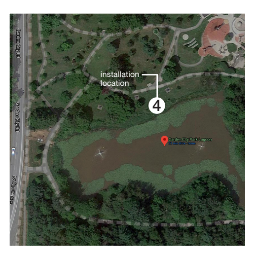
Location 4: Garden City Community Park 6620 Garden City Road - north side of the pond