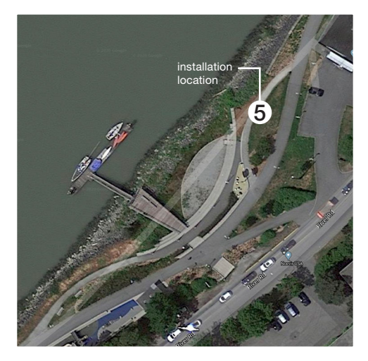
Location 5: Middle Arm Waterfront Park 7411 River Road - east of the UBC Boathouse