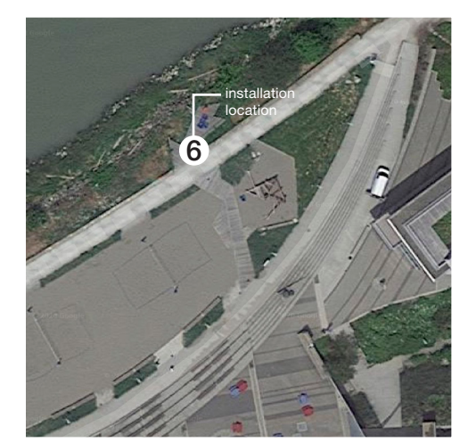
Location 6: Middle Arm Waterfront Greenway 6111 River Road - in front of the volleyball courts