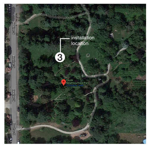
Location 3: Paulik Neighbourhood Park 7620 Heather Street - Paulik Park garden