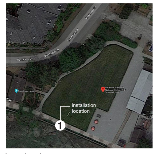
Location 1: Britannia Shipyards National Historic Site 5180 Westwater Drive: along the boardwalk in front of the dock