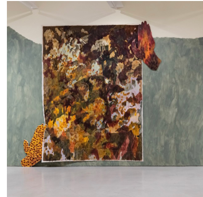
Derek Liddington, The trees weep, the mountain still, the bodies rust (installation view), 2022; Musée d'art de Joliette.