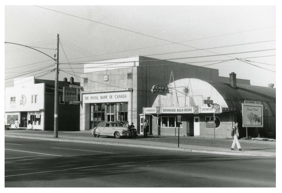
No.3 Road and Park Road (1958)

June 1948 saw yet another choice for entertainment when the Boladrome was opened at the corner of No.3 and