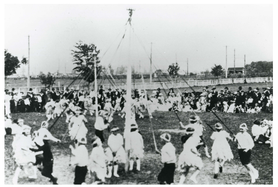
Maypole dancers (ca. 1930)