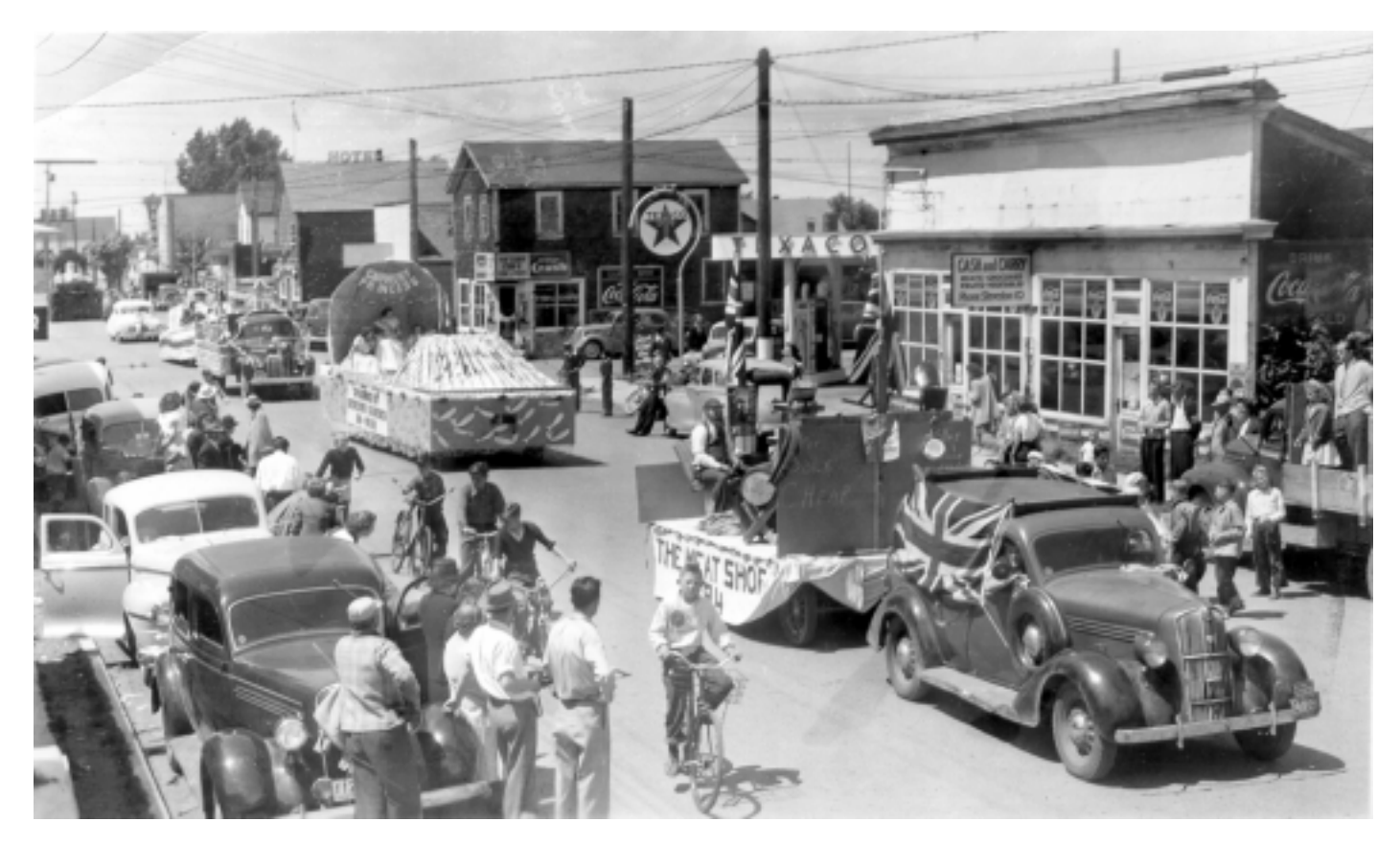
Salmon Festival Parade on Moncton Street c.1949