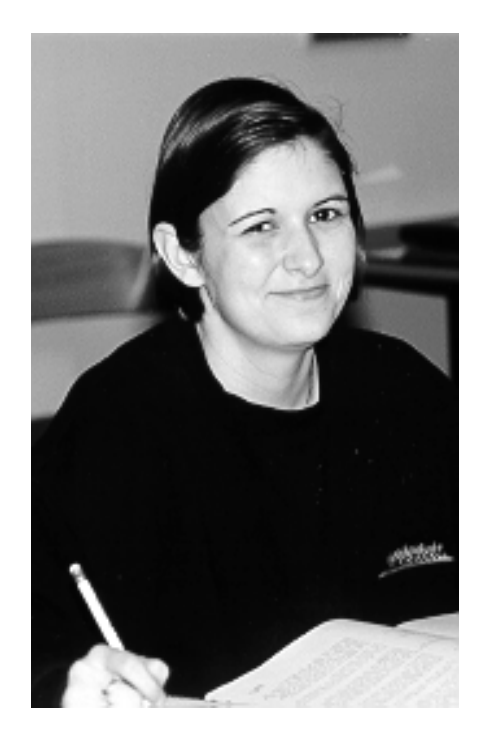
Who uses the Archives?

ARCHIVES Online , the City of Richmond Archives software add-on for use with Inmagic database software has continued to sell across the country and in three foreign countries as well. To date 41 copies have been sold. Revenue from sales is shared among the seller, Andornot Consulting Inc., the City, and the Friends of the Archives. Proceeds from sales have been used by the Friends to support the Archives through purchase of equipment and software.