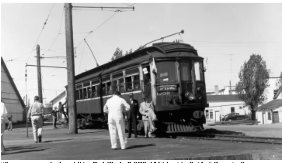
"Steveston - end of track" by Ted Clark, BCER 1208 beside Gulf of Georgia Cannery c.1952. Accession 1999-4

Archives provide you with a variety of source documents that you can use to determine or confirm the answers to a wide range of questions. Using multiple sources reveals more detail and strengthens your result.