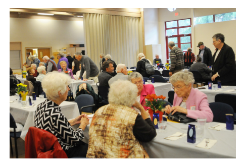
Friends of the Richmond Archives Tea, 2016.

Once again the Friends would like to thank the Board of the Minoru Seniors Society and the staff at the Minoru Place Activity Centre for their support and assistance.