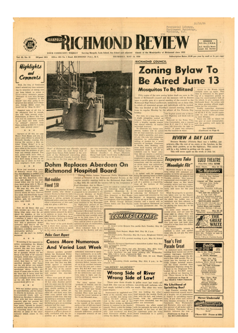
Page 1 of the Marpole-Richmond Review, May 24, 1956.

Council Minutes February 4, 1946, Resolution 8711.