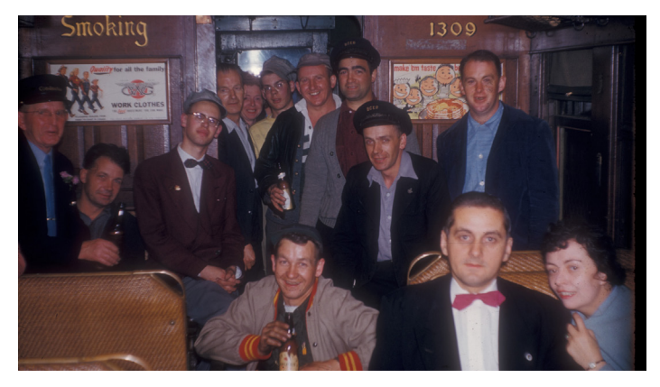
Group Prom Last Central Park Line Run, New Westminster Barns, July 16 1954.