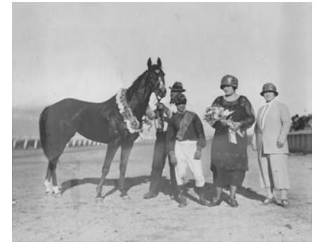
Shadow Spark in the winner's circle following the 1924 BC Derby held at Lansdowne Park in its first year of operation.

City of Richmond Archives Photograph 2015 3 1