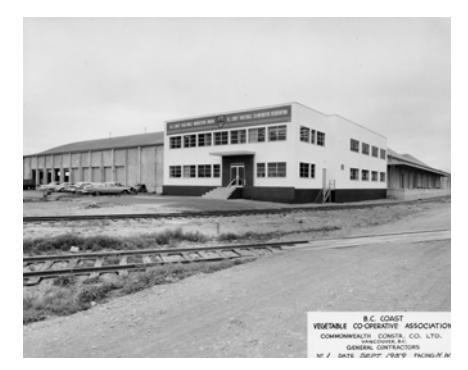
The BC Coast Vegetable Co-operative Association's Richmond plant at the time of its official opening in 1959.