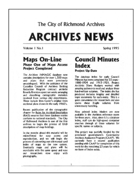
Front page of Volume 1, Number 1 of the Archives News, 1995.