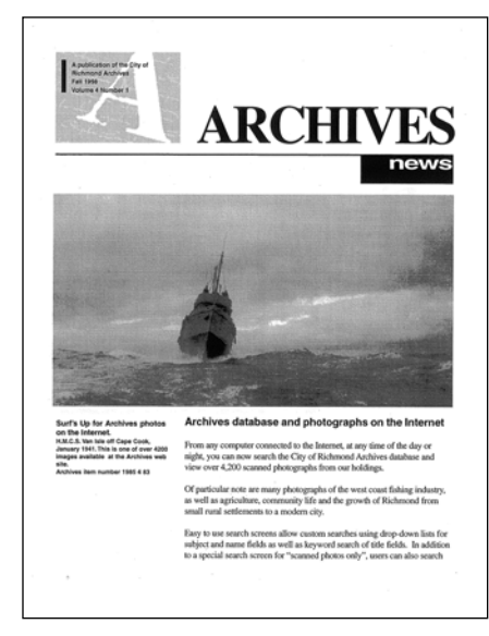
Front page of issue announcing the launch of the Archives' online photograph database, 1998.