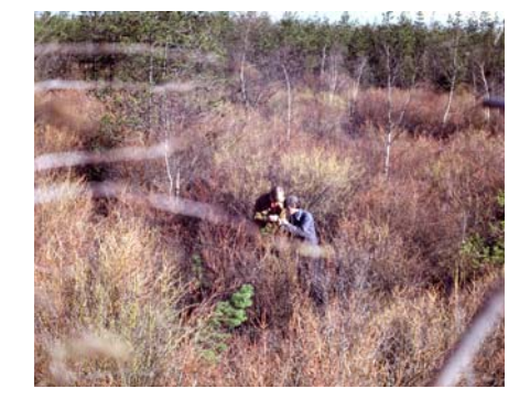
Field researchers in the bog at Richmond Nature Park, 1972. City of Richmond Archives Photograph 2015 8 a