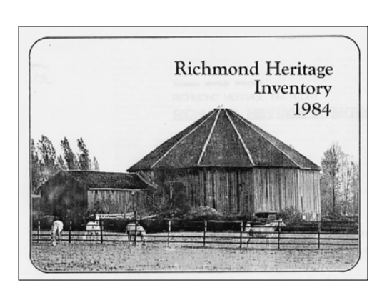
Cover of the first Heritage Inventory for Richmond, 1984 City of Richmond Archives GP 34