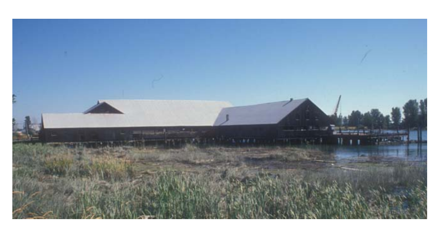
Britannia Shipyard area, 1988

The City of Richmond Archives has comprehensive records documenting heritage preservation activities in the community, dating back to the records of the Historical and Museum Advisory Committee and including minutes, research files, project files, studies and reports of the Heritage Advisory Committee/Heritage Commission. In addition, records of the Engineering Department and the Leisure Services Department document restoration, maintenance and programming activities at municipally-owned heritage sites. Records of the Planning Department, Law Department and Clerk's Office provide an accurate picture of the process by which heritage properties were acquired, and how policies relating to non-City owned property of heritage significance have developed.