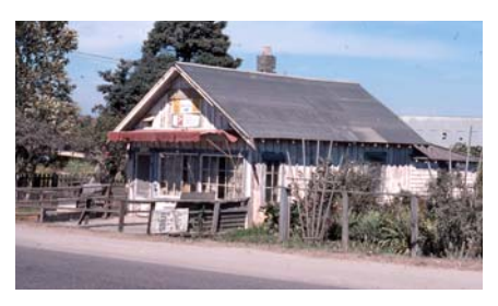
Old Ferry Inn, No. 5 Road at Woodward's Landing, 1977.

Photo #1997 42 1 621