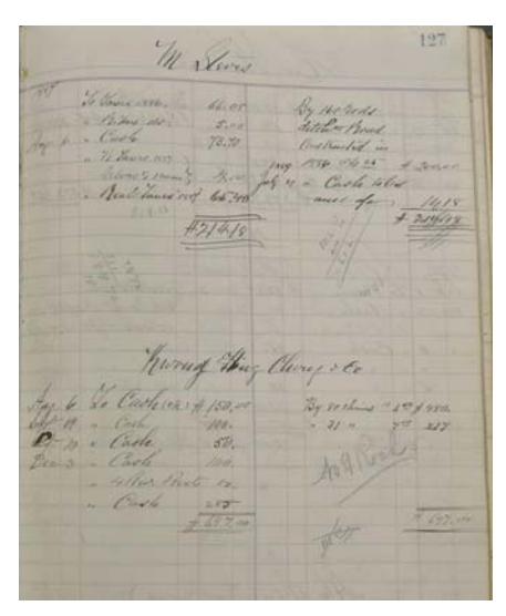
Page from Tax Ledger, 1887.

City of Richmond Archives MR Series 2, File 5.