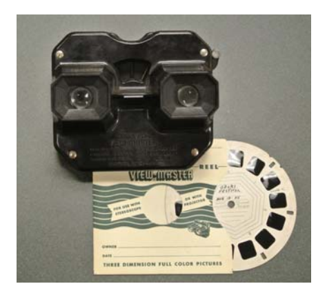
Viewer and personal ViewMaster reel of images of the Japanese Odori Festival in Steveston, 1955.

Most people will remember a popular pre-digital form of entertainment called the ViewMaster, which used a stereoscopic viewer and photo transparencies mounted on a disk to create a 3-D image.