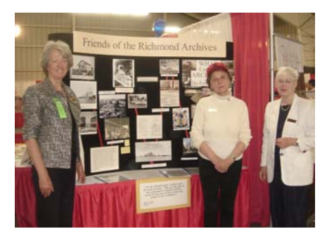
Left: Visitors taking the history challenge at the Friends' booth at London Farm