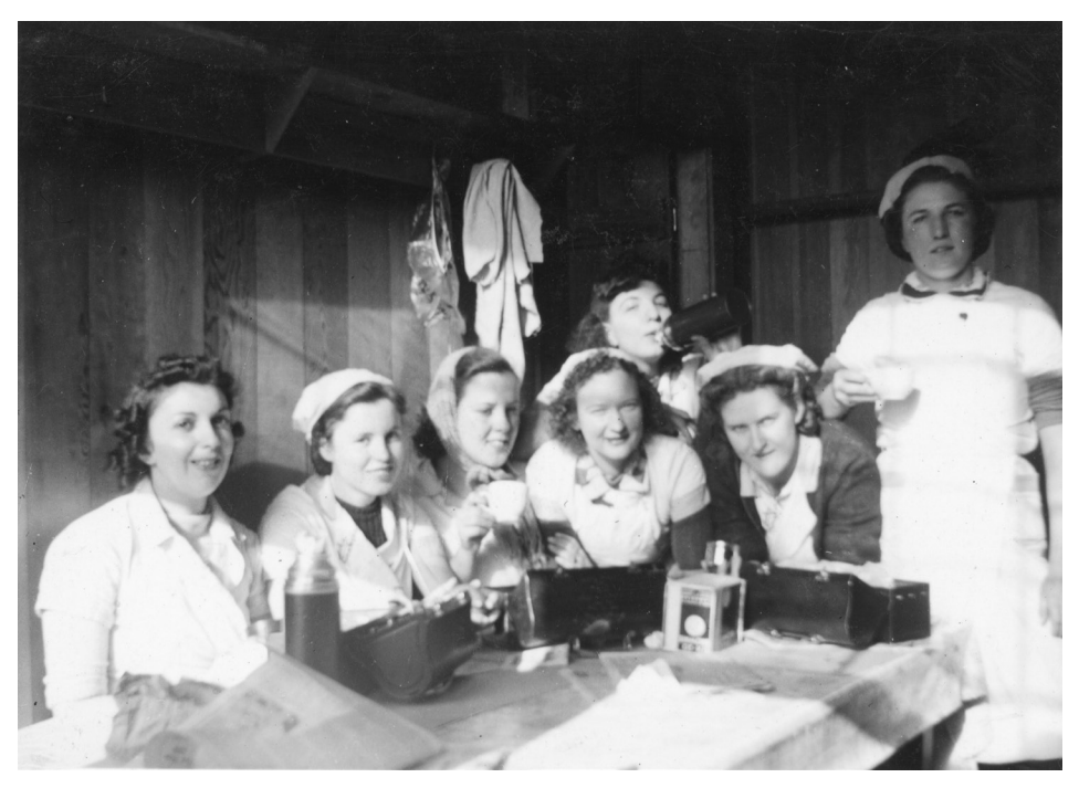
Accession 2020 8 – Steveston cannery workers, ca. 1937.

Other accessions included photographs of everyday working life at a Steveston Cannery, and the not so typical life of an Olympic athlete: