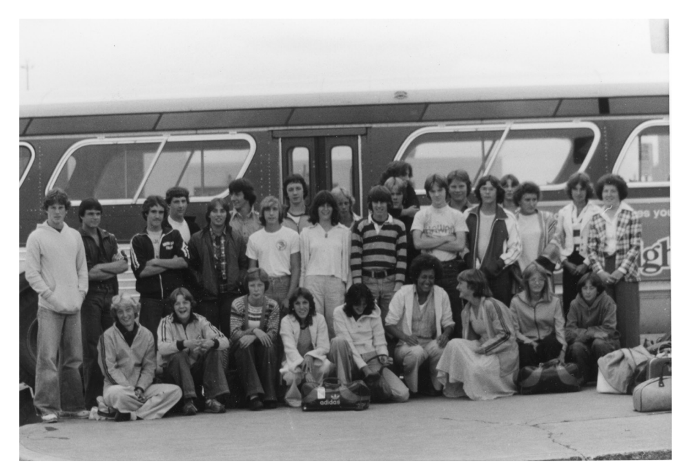
Accession 2020 9 - Kajaks team traveling by bus, date and event unidentified.