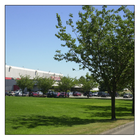
Screening Land Uses along the Highway