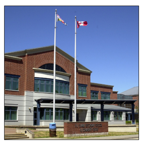
Cambie Community Centre and School