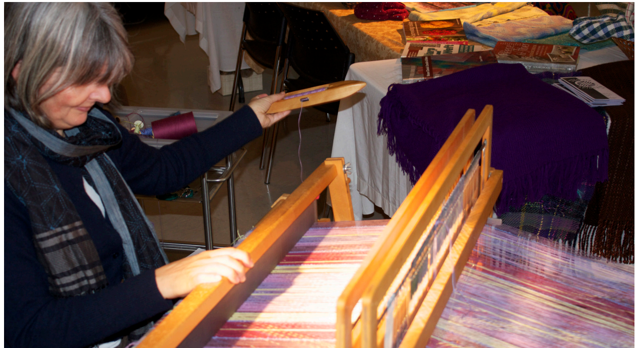
Resident Art Group Showcase, Richmond Weavers and Spinners