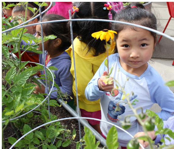
Richmond Cultural Centre Rooftop Garden

Presenting sponsor, Canadian Western Bank provided $31,000 in sponsorship to support the Garden's activities in 2012. Attendance through programs in this unique space: 405 adults and children.