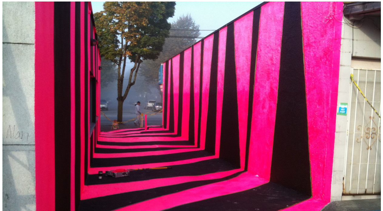
Nothing Happens in Good Weather (2011–2013), Instant Coffee