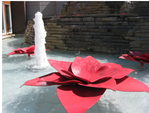
Saffron Drift , Muse Atelier. Location: Saffron, 8600 Park Road