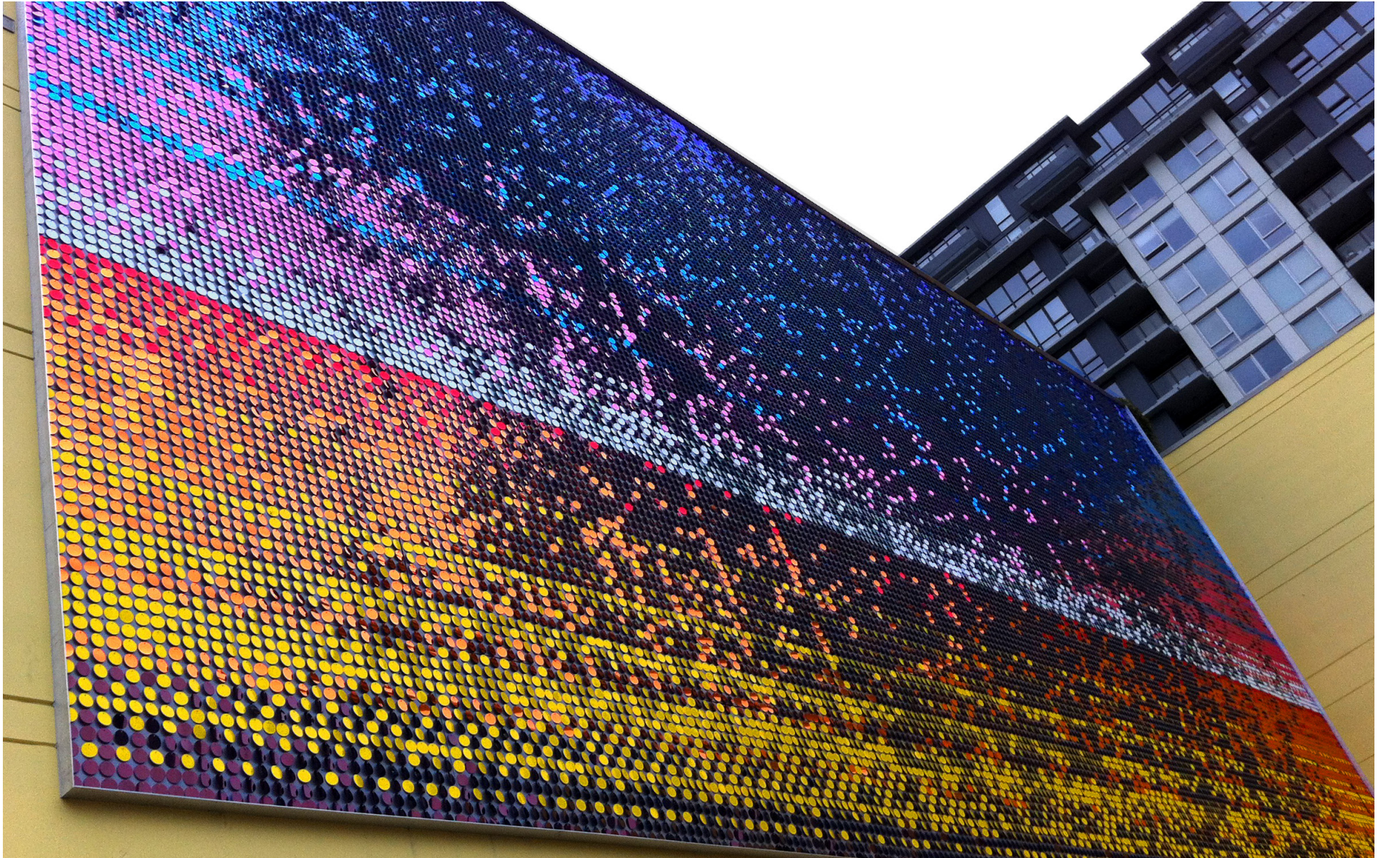
Perpetual Sunset (2012), Instant Coffee. Location: Camino, 8680 Westminster Highway