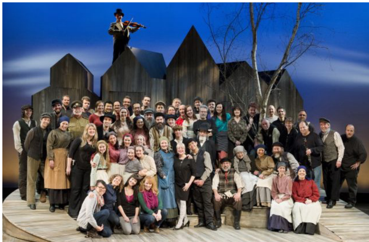
Fiddler on the Roof. Cast, crew, creative team and orchestra pose, Gateway Theatre.

(Langara College) participated as assistant directors, actors and apprentice designers; students from Douglas College and Capilano College participated as backstage production team and actors; and students from Kwantlen Polytechnic University studied not-for-profit financial and management structures.