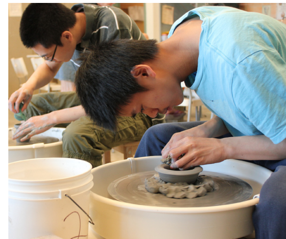
Pottery Class, Richmond Arts Centre

For the second year in a row, the Richmond Youth Dance Company impressed audiences with their new mainstage production, Through The Clouds attended by 150 people. The company also made special appearances at Doors Open, the Minoru Activity Centre, the UROC awards, the year-end recital at Gateway Theatre and the Steveston branch opening for G & F Financial Group. In December, the group performed in partnership with the Delta Youth Orchestra at Landsowne Mall and the Genesis Theatre in Ladner. Their five performances garnered an audience of 850 people. The twenty dancers, aged 9–17 years exemplify a positive example of youth contributing to the City's vibrant atmosphere.