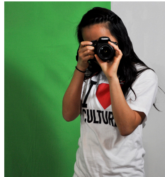
Culture Days, Richmond Cultural Centre