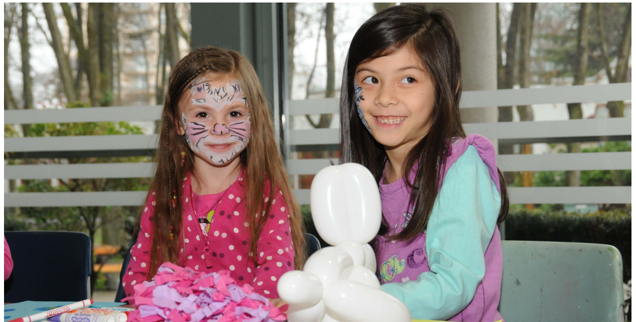
Children's Arts Festival, Richmond Cultural Centre