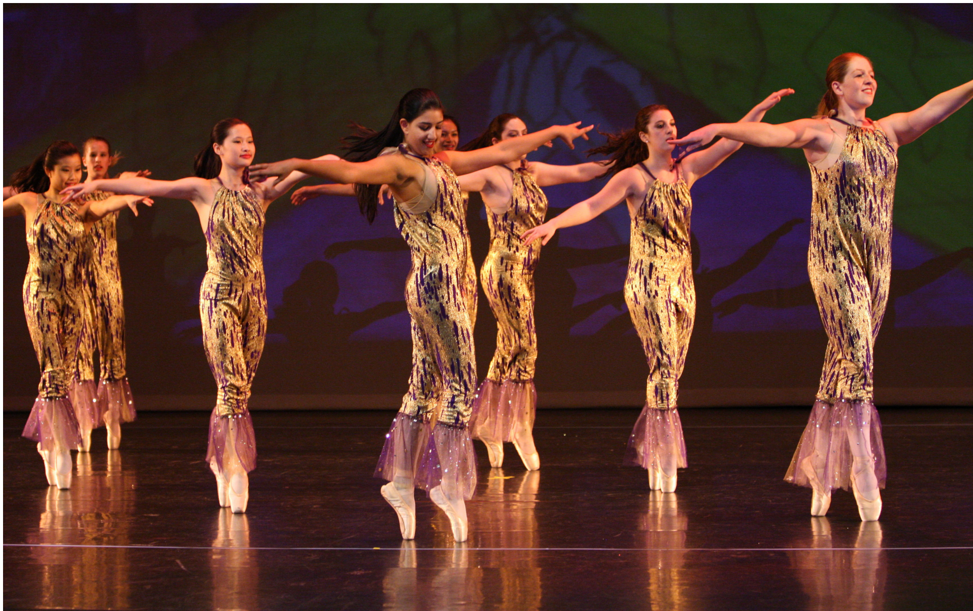
Richmond Youth Dance Company