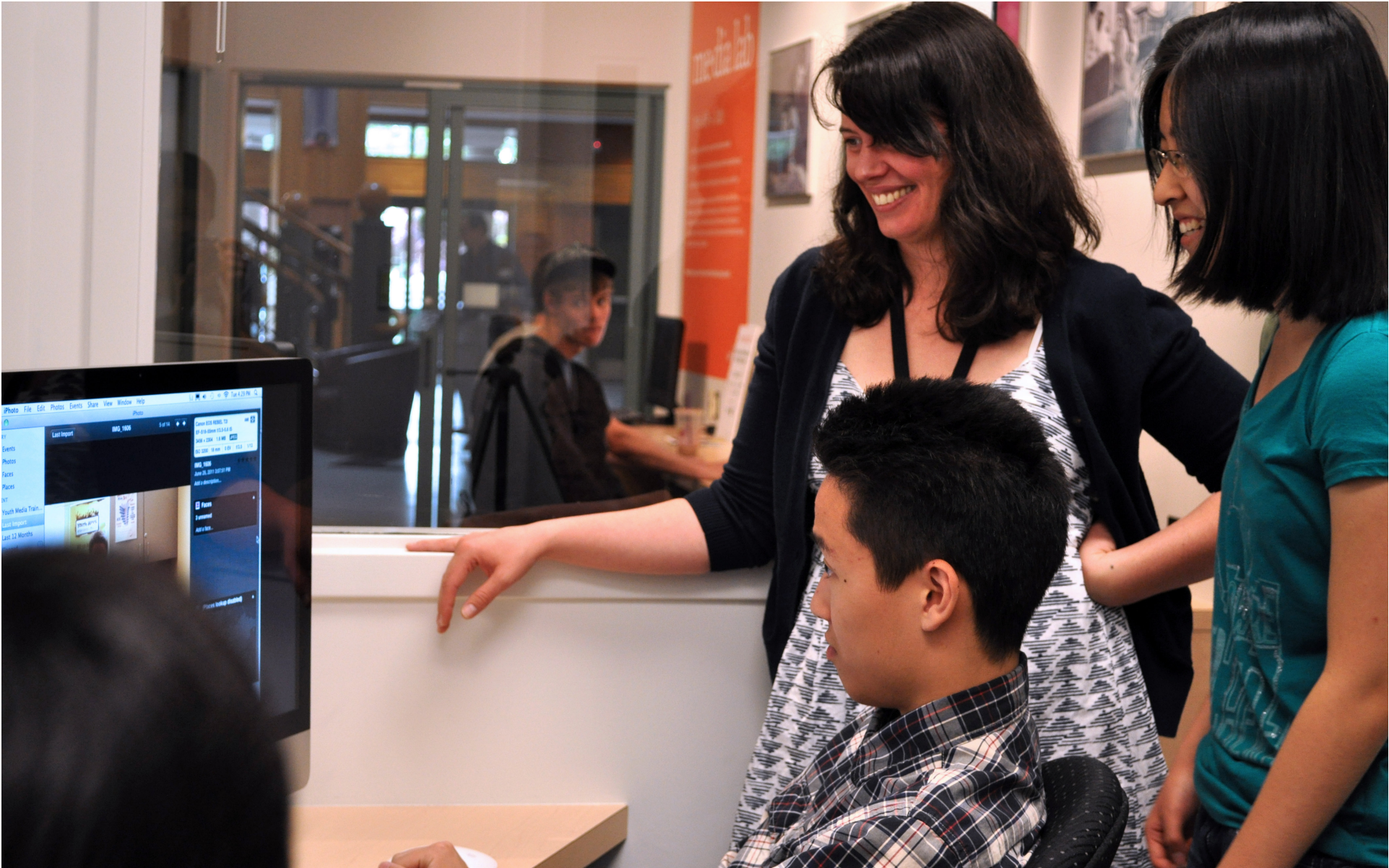
Richmond Media Lab