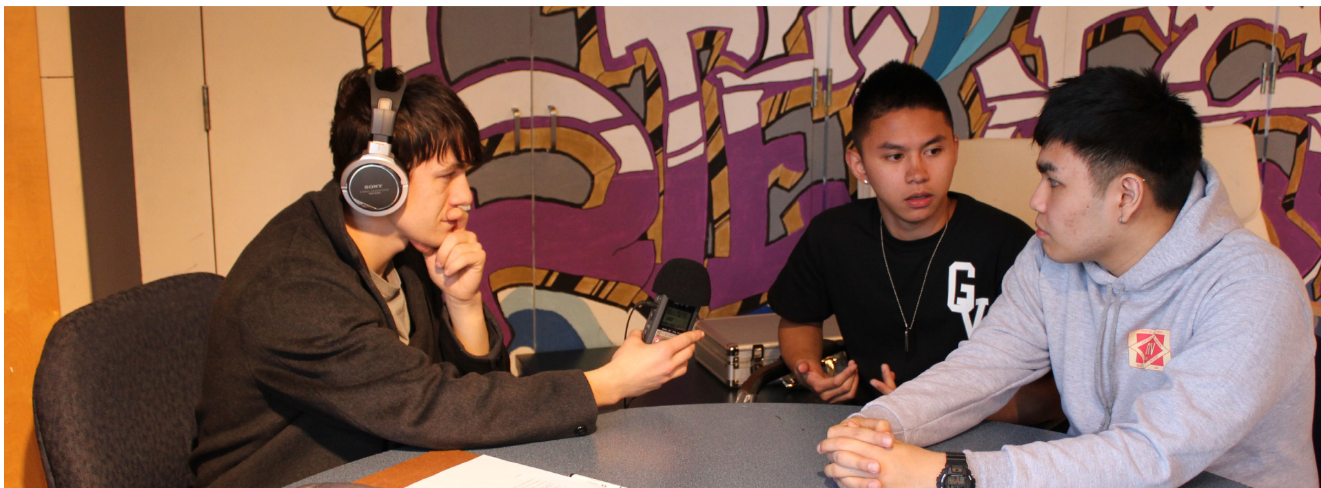
Richmond Youth Media Program, Richmond Media Lab

This program is made possible through a $96,000 grant over three years from the Vancouver Coastal Health SMART fund. Sponsorship from Richmond Steel Recycling Ltd. for three years in the amount of $36,000 helps support staffing and equipment.