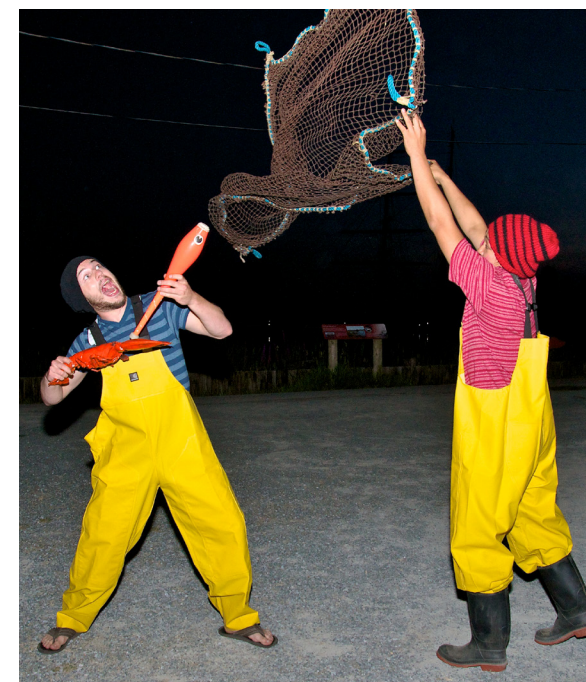
Roving Performers, Richmond Maritime Festival

In its ninth incarnation and second year as a multi-faceted large-scale cultural event, the Maritime Festival at Britannia Heritage Shipyard delighted an estimated 35,000 attendees from August 10–12. The heritage site was transformed with inventive art installations, roving performers, staged events and many creative interactive activities involving local artists and guilds. The festival also attracted sponsorship of over $90,000 in cash and over $20,000 in-kind support.