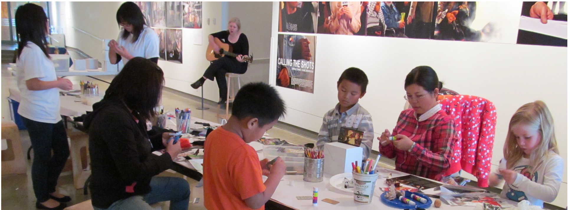
Family Sunday, Richmond Art Gallery

The Richmond Art Gallery School Art Program provides hands-on art experiences for young artists. The program introduces students from Preschool to Grade 7 to the exciting world of contemporary art through interactive gallery tours and exhibition-based, hands-on art activities. A concerted effort is being made to engage more of the Secondary School Audience, and through the assistance of a BC Arts Council Co-op Placement grant and funding from Canadian Western Bank, the Gallery hired an intern to develop a needs assessment and online resource guides for