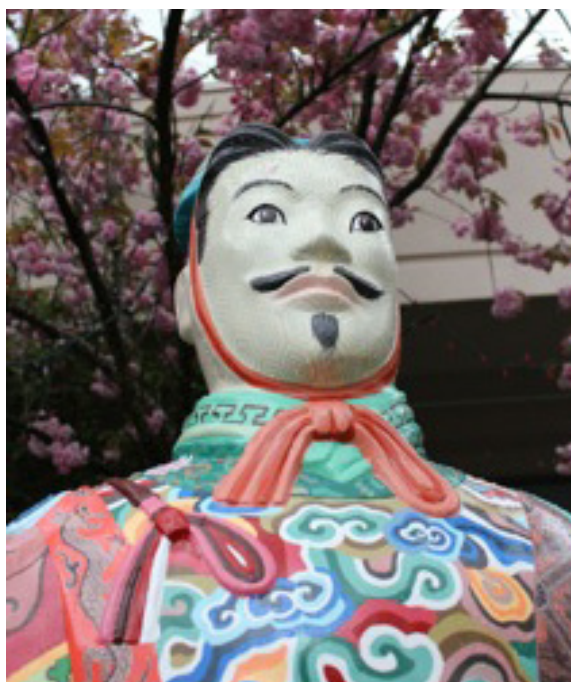
Terracotta Warrior, Minoru Plaza