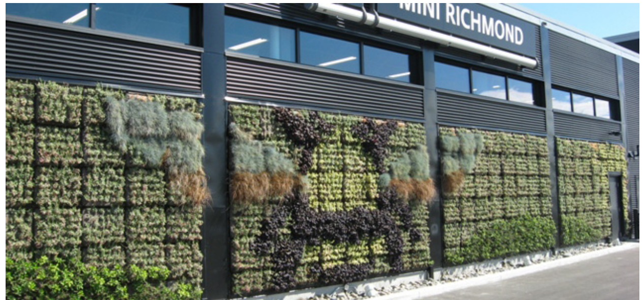
The Bee (2012), Mini Dealership. Location: 10700 Cambie Road