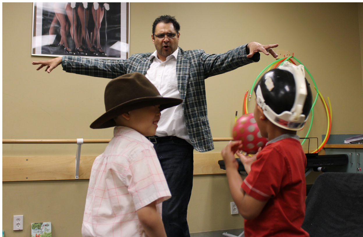
Drama Class, Richmond Arts Centre

students as scenic backdrops while students from the Musical Theatre program performed and sang alongside the dancers. 1126 audience members enjoyed over 400 performers, aged 3–17 years, in Let’s Go To The Movies , which took the viewers on a nostalgic tour of film history.