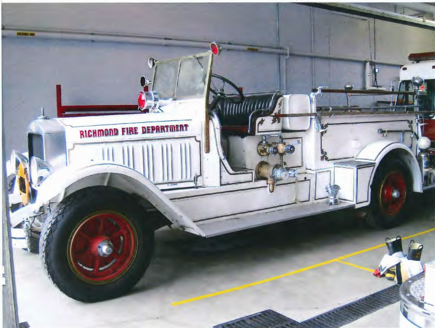
Image of the 1931 LaFrance Fire Truck