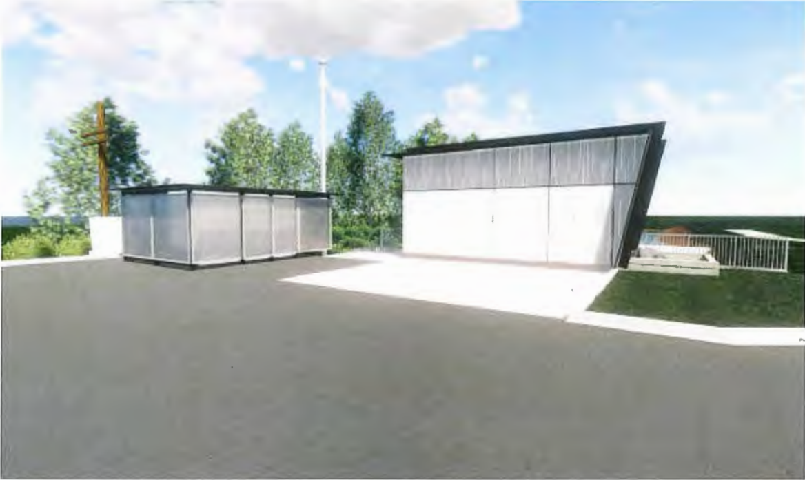
2. 3D Rendering – Looking South West