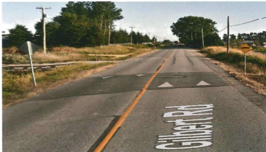
Example of Existing Speed Hump (as proposed) on Gilbert Road (south of Steveston Highway)