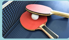
Table Tennis - Beginner