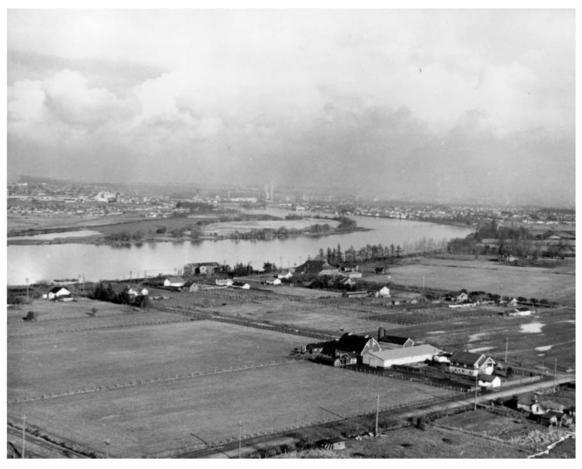
Holt Farm in the foreground, Olympic Speed Skating Oval site at the middle right on the shore of the middle arm of the Fraser River.

In 1864, Samuel Brighouse purchased 697 acres on Lulu Island which encompassed the site of the future Olympic Speed Skating Oval at 6080 River Road.<sup>2</sup> For over a century the property was occupied by residences and used for raising crops and livestock. It was purchased by the municipality in 1962 as part of the Brighouse Estates and until 1975, the municipality allowed lessees to rent residential property. As part of the Brighouse Industrial Estates, the property was given a light industrial/recreational zoning but remained vacant until leased to the Richmond Recreational Vehicle Park in 1986. Located along the middle arm of the Fraser River, between the No.2 Bridge and the Dinsmore Bridge, the Olympic Speed Skating Oval site occupies a key piece of Richmond real estate.