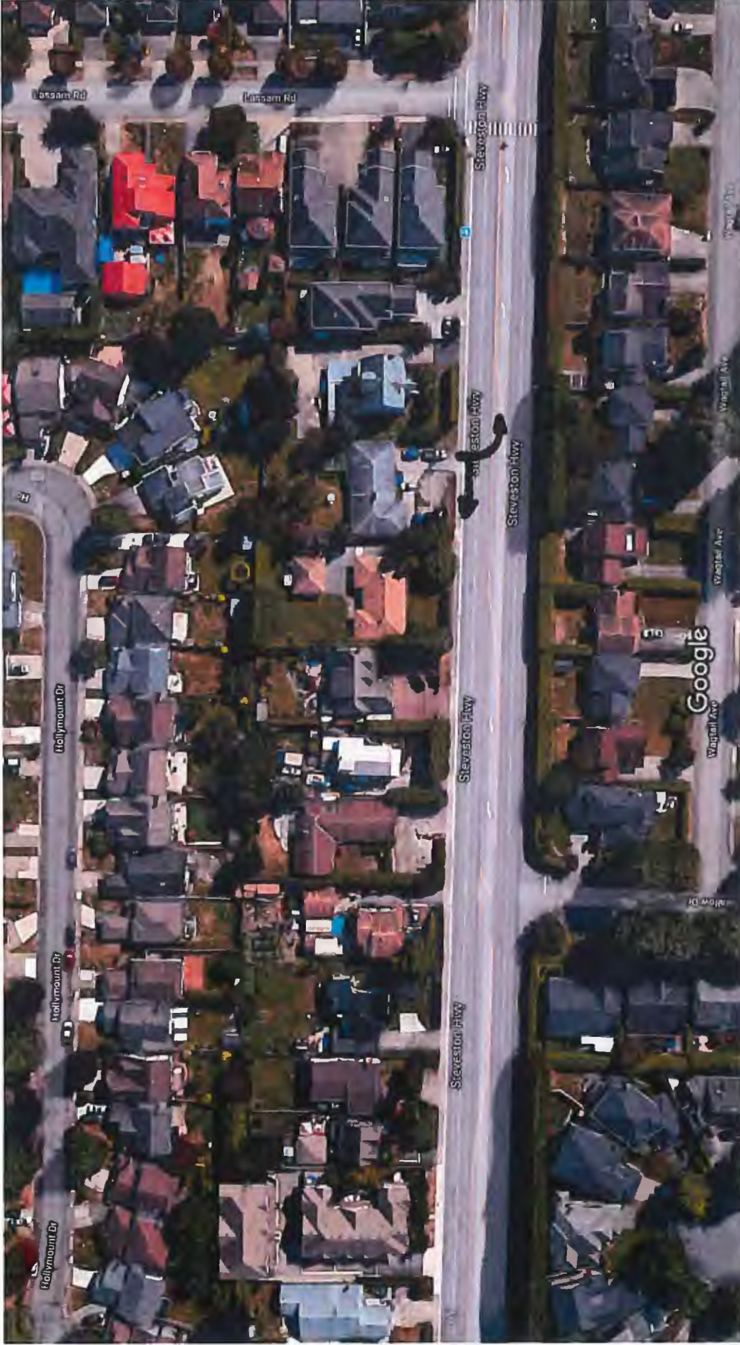
20 m

An access point from approximate location of 5331 Steveston Hwy could utilize existing left turn lane if it was extended approximately 50 m to the west