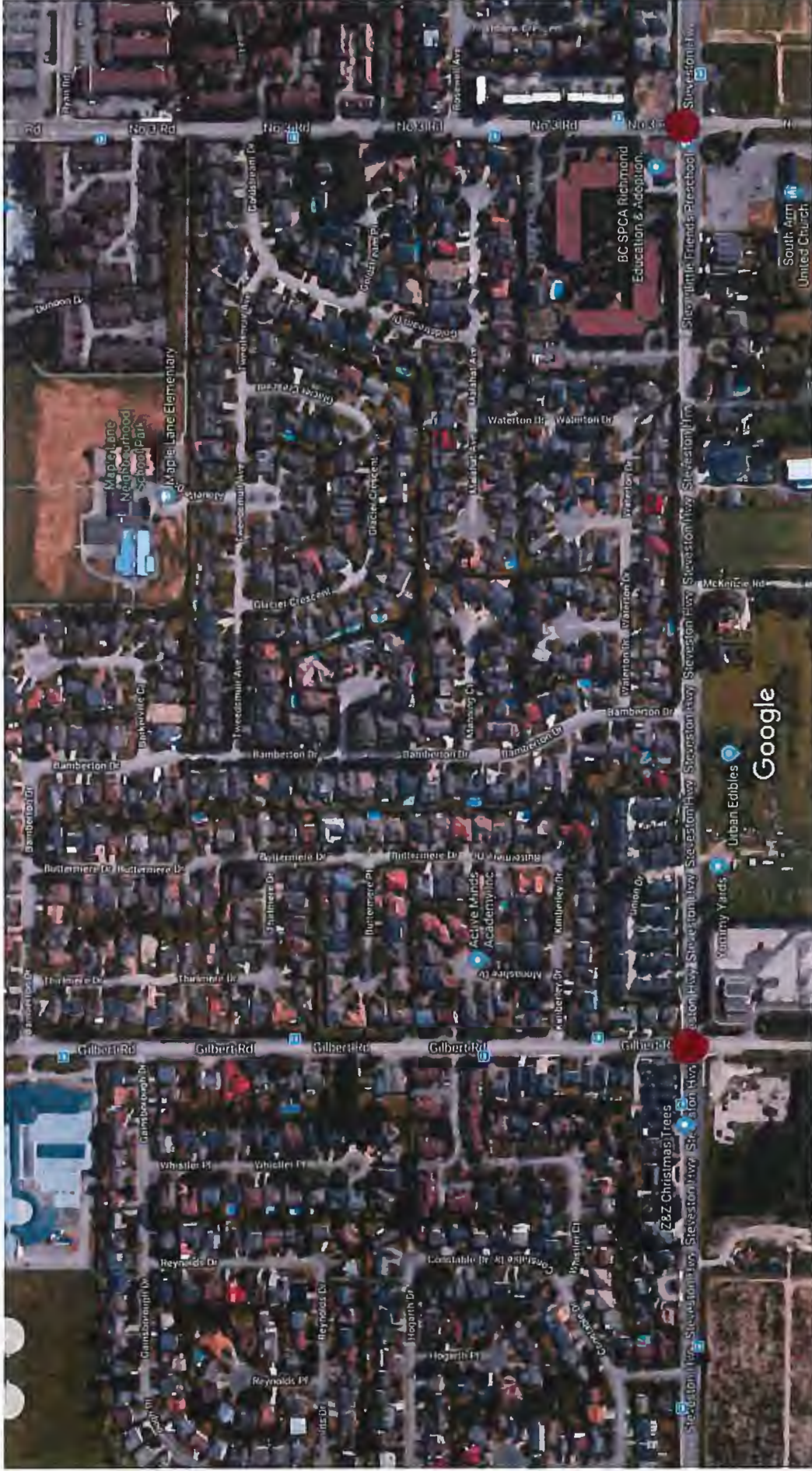
Imagery ©2018 Google, Map data ©2018 Google 50 m

Gilbert to No.3 Rd Several developments accessing Steveston Hwy, but again, no traffic signals except at Gilbert & No.3