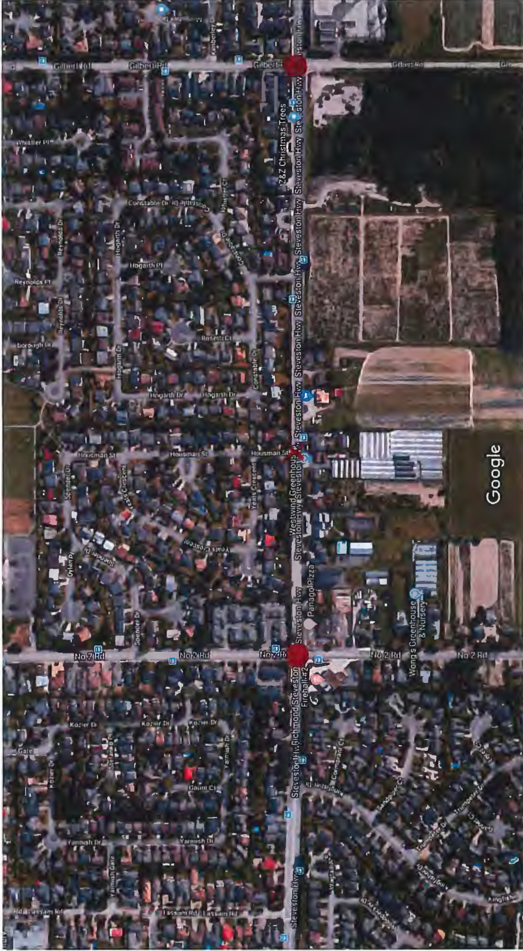
50 m

No. 2 Rd to Gilbert has one pedestrian crosswalk, but again no traffic signals except at No. 2 & Gilbert