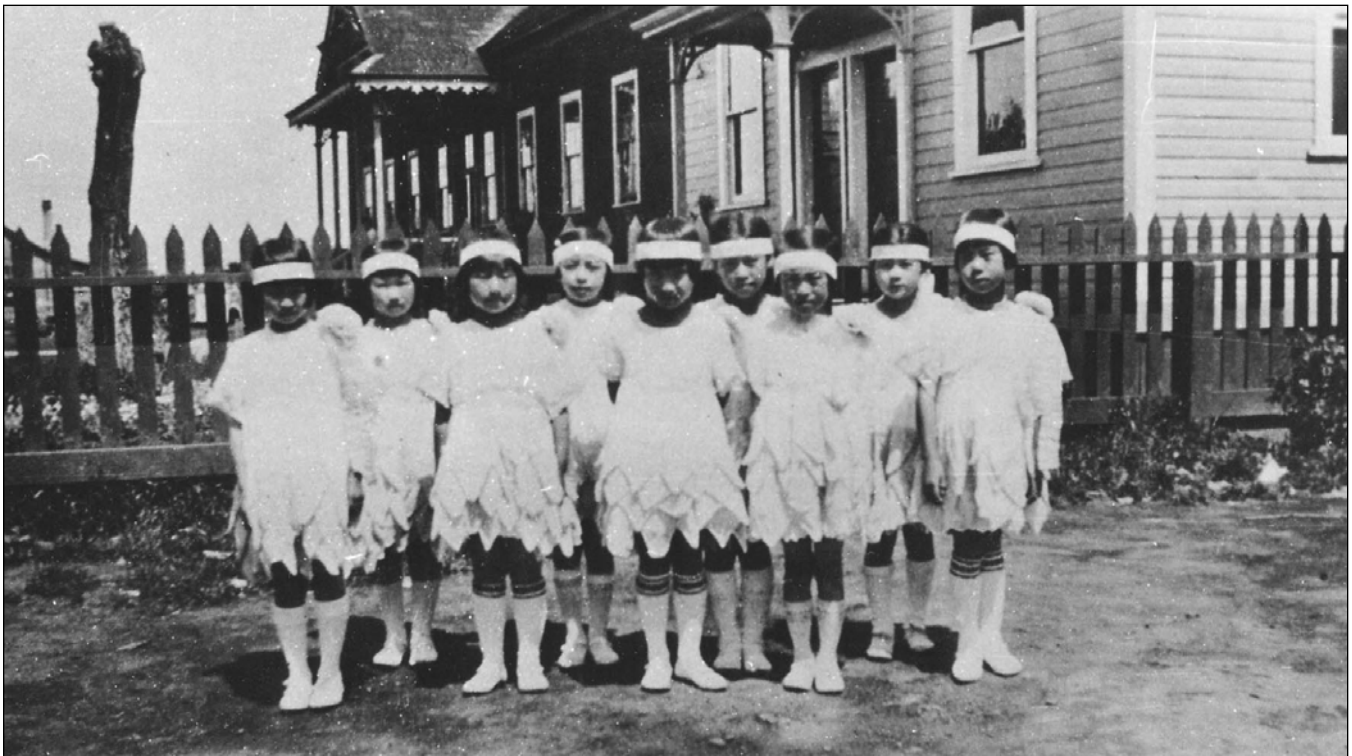
Photograph of students in traditional May Day dress standing outside the Steveston Japanese School, May Day, 1930. The Steveston Fishermen's Hospital is the building to the far left, and the Doctor's and Hospital Offices (in the original location, now 4091 Chatham Street) is the building to the right.