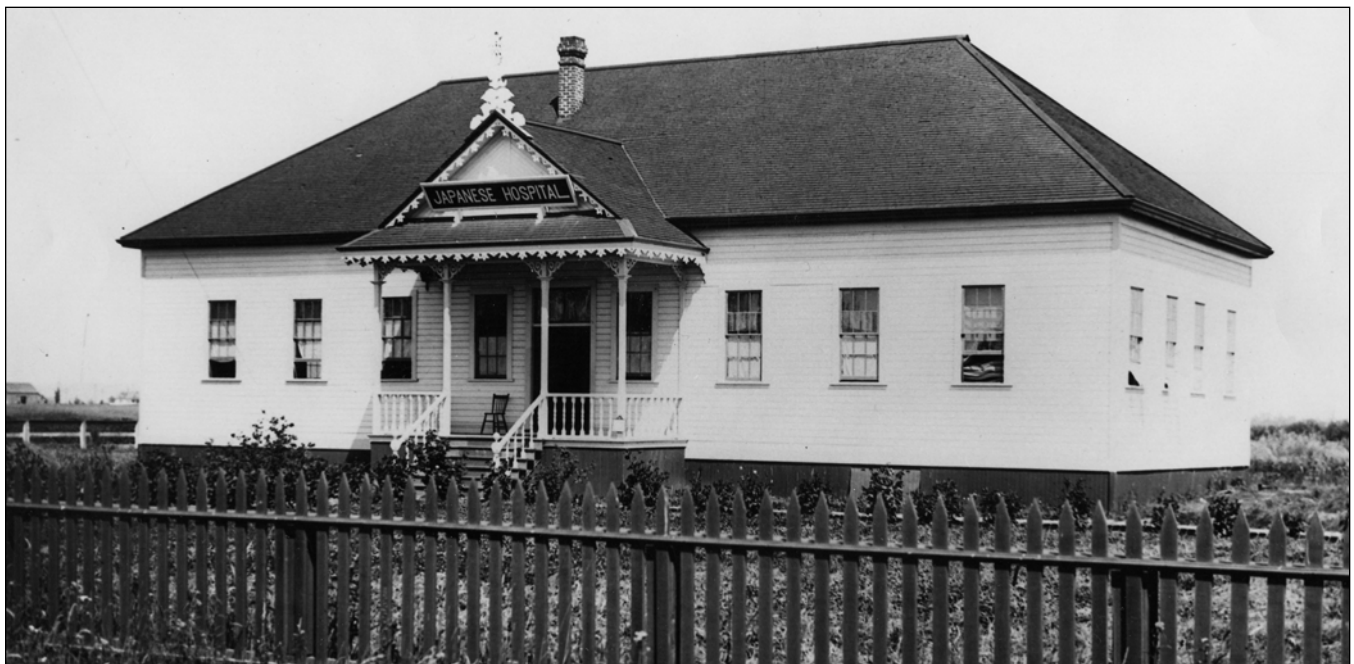
Photograph of the Japanese Hospital in Steveston circa 1920, showing some of the gardens in front of building.

Please tell us where on the Survey Questionnaire.