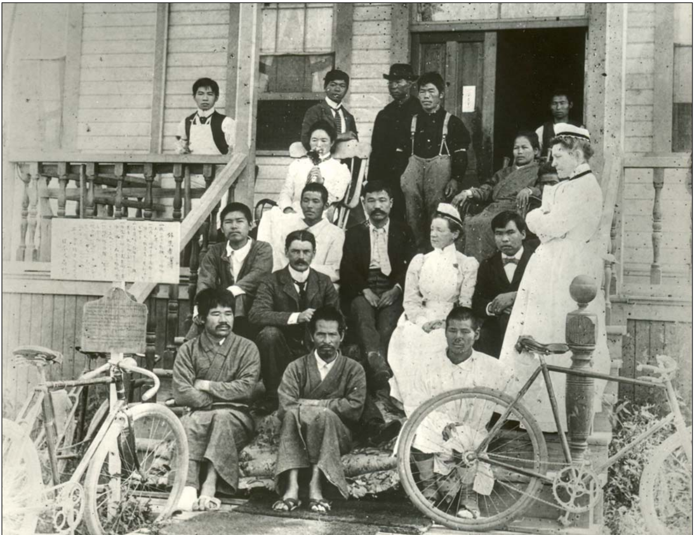
Photograph of a group of nurses and patients on the front steps of the Japanese Hospital in Steveston circa 1900.