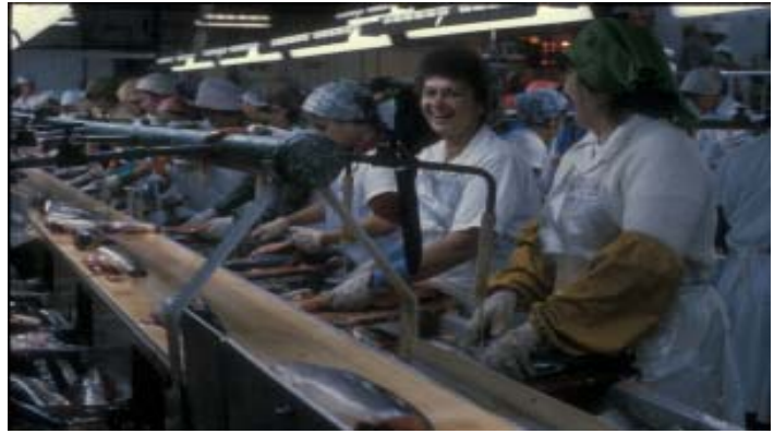
Women cleaning salmon at a sliming tank, circa 1970s.