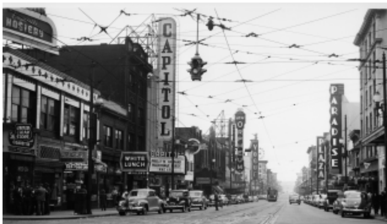
Granville Street looking north from Robson. The photographer of this 1948 image is unknown.