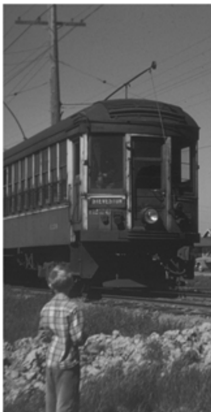
A young "traction" fan watches B.C. Electric Railway car 1220 as it nears Woodward's Road on Railway Avenue, 1957.