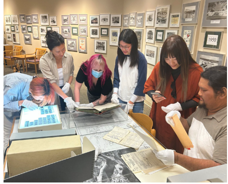
Secondary School Teacher Candidates