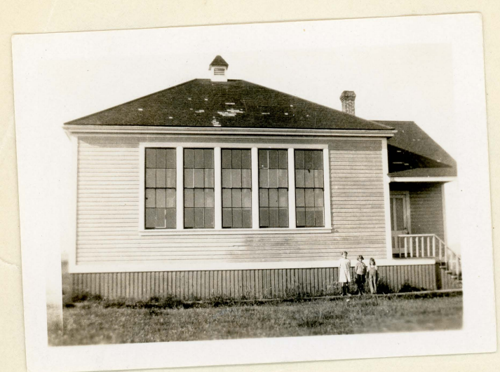
Trites School at the upper and of the Island.