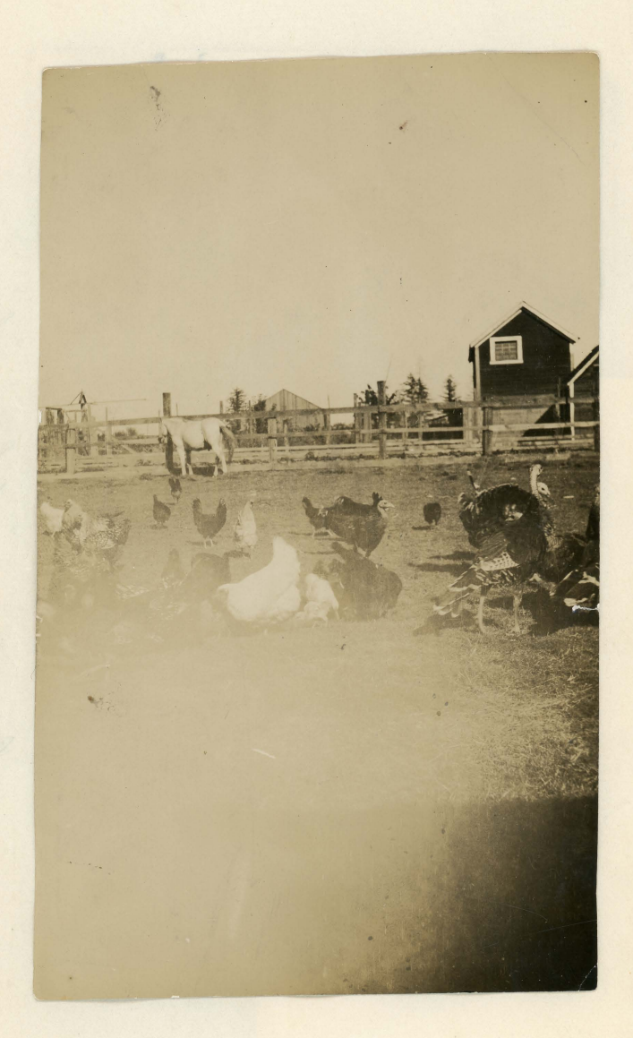
a Real Farm yard.