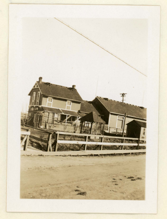
B.l. Electric Station Steveston