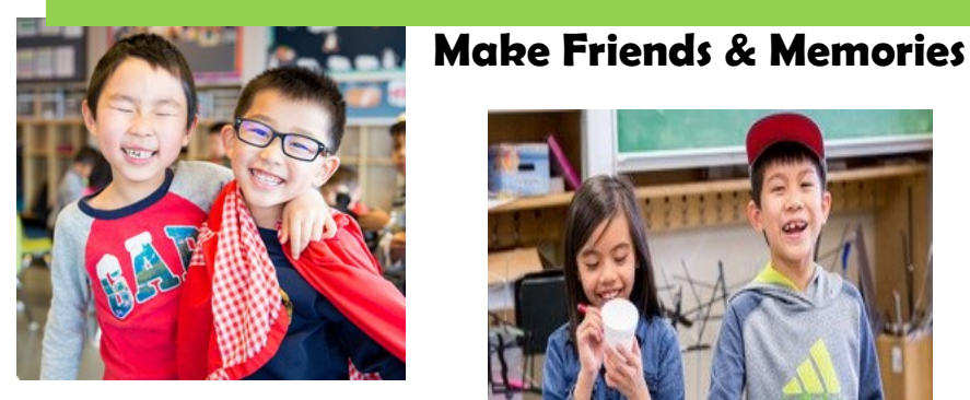
COME PLAY WITH US!