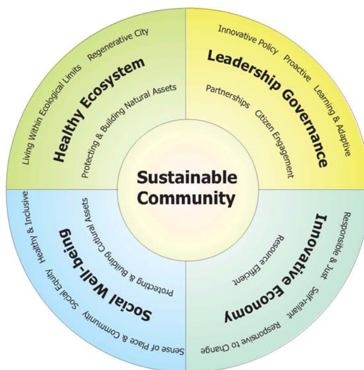
Figure 1: Conditions of A Sustainable Community