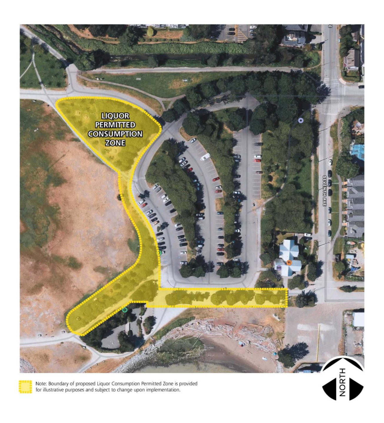
Garry Point Park