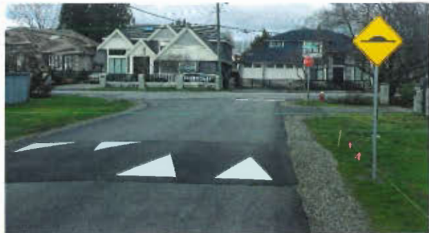
Figure 2: Speed Hump and Stop Sign on Diamond Road at Barmond Road