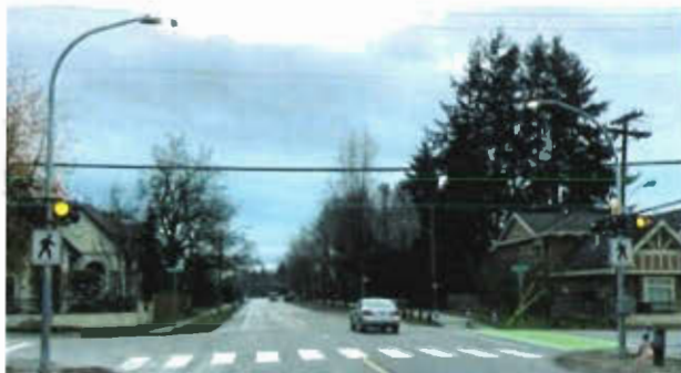
Figure 1: Special Crosswalk at Garden City Road-Saunders Road

A total of nine groups of City projects fully or substantially completed in 2019 (Attachment 1) will receive a total of $200,000 from ICBC’s 2019 Road Improvement Program (sample of completed projects shown in Figures 1 and 2).