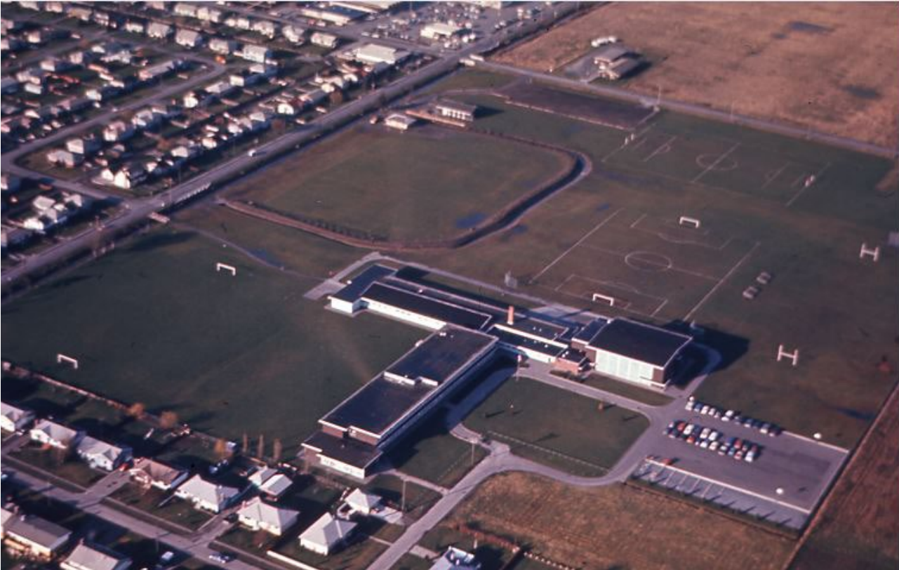
Figure 4. Hugh Boyd Community Park, January 1970.