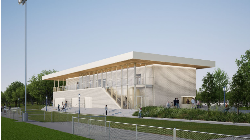
Figure 1. West Richmond Pavilion. Architectural rendering.