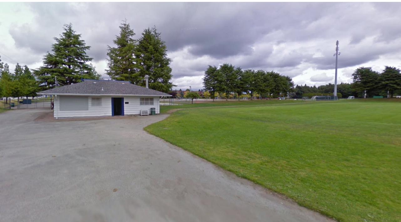
Figure 5. Existing Hugh Boyd Fieldhouse.