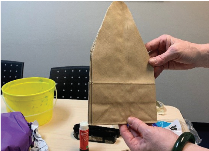
Step 3: Cut the petal shape for your flower.