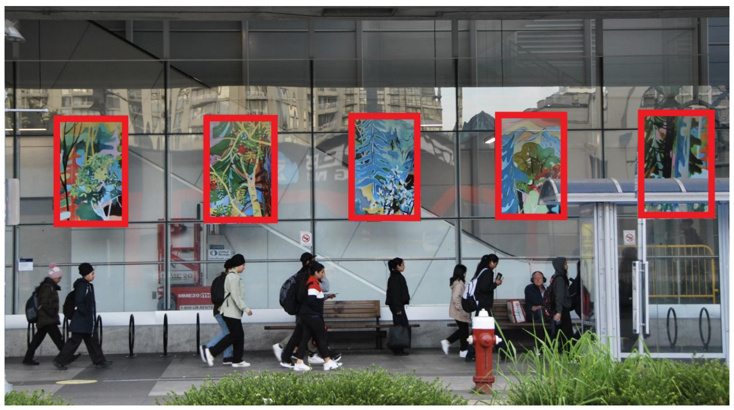
Figure 3. Richmond-Brighouse Canada Line Station Artwork Location. Five panels, required artwork area for each panel: approx. 4ft. x 6ft. for East glass wall building façade facing No.3 Road. Image: Simone Guo, Homecoming , 2023.

Note: Commissioned artists will be required to submit print-ready artwork files with a minimum resolution of 100 dpi for final output size. File types supported: EPS, INDD, PDF, PSD, JPEG, TIFF.