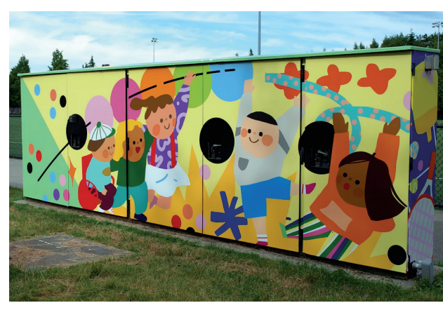
Community by Dawn Lo, 2022, West Richmond Community Centre

Deferment applications must be submitted online at www.gov.bc.ca/propertytaxdeferment.