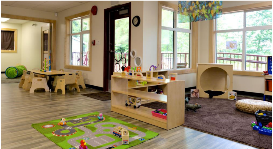
Cranberry Children's Centre, Richmond