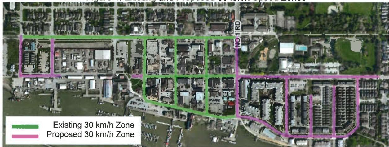
Figure 1: Existing and Proposed 30 km/h Speed Zones

Figure 1 illustrates the existing and proposed 30 km/h zones for the Steveston Village area. Attachment 1 provides the proposed new Schedule B to Traffic Bylaw No. 5870.