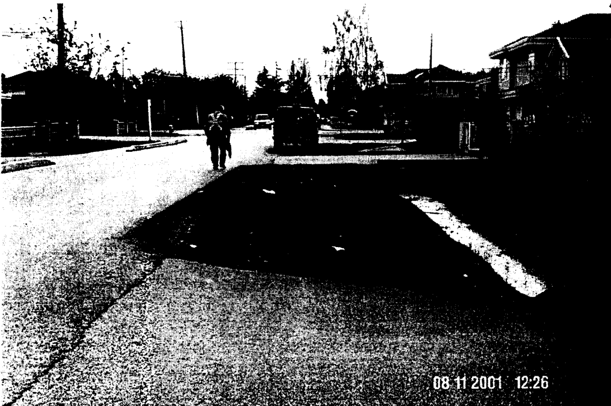
LEONARD RD LOOKING SOUTH