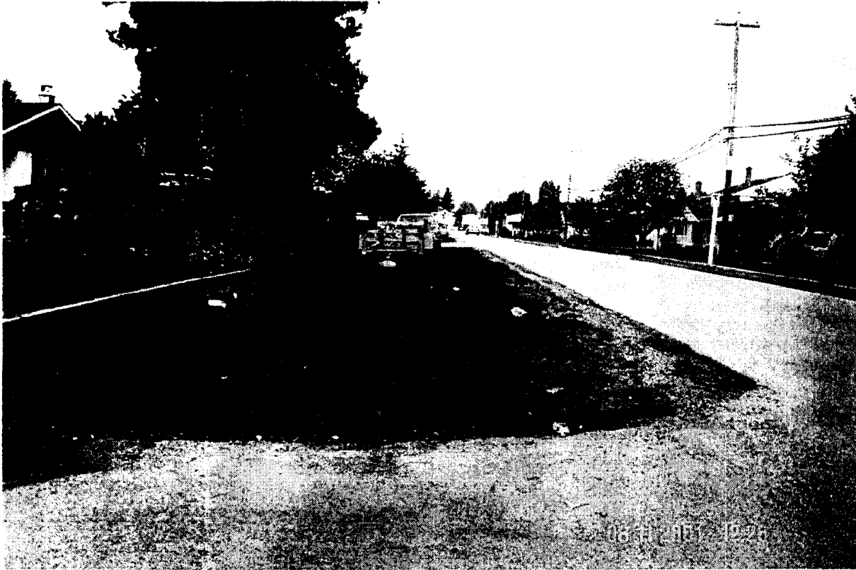
LEONARD RD LOOKING NORTH