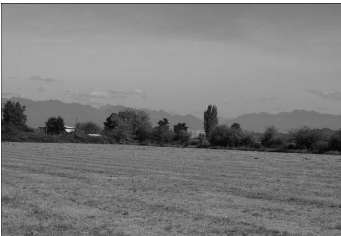
Tera Nova's agricultural fields