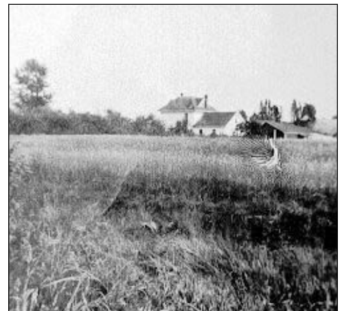
View of Tera Nova c.1915