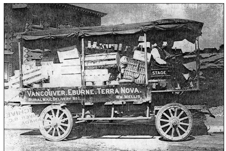
Mellis' stage coach operation