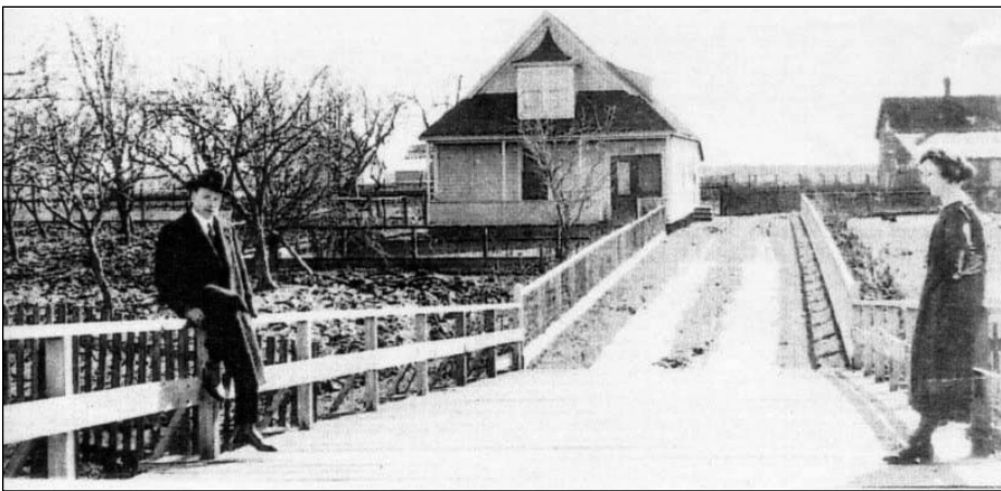
Gordon Property c.1912