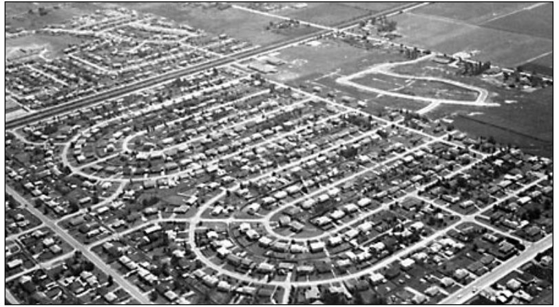
Subdivision in Shellmont Area. Aerial photograph of a subdivision located between no. 4 Road and Shell Road just north of Steveston Highway. circa 1960

André Cardinal - Ph: 604-274-0118, email: andre_cardinal@telus.net