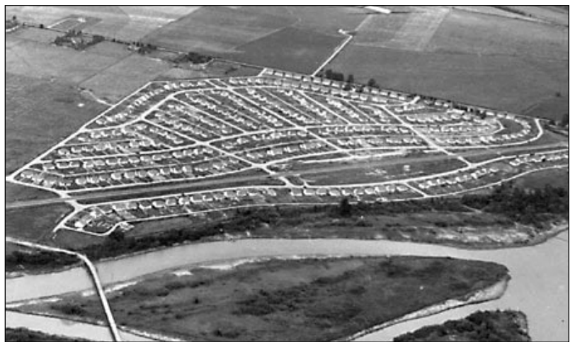
Burkeville. Aerial photograph of the newly constructed Burkeville subdivision on Sea Island. 1944