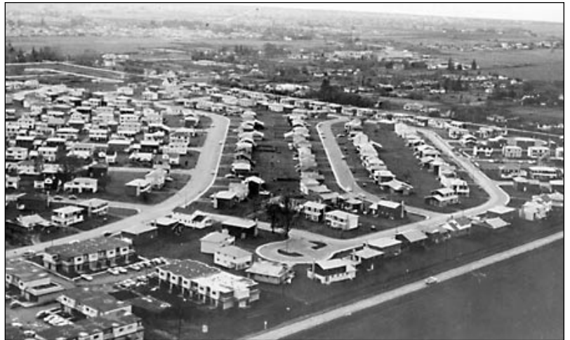
Richmond Gardens. Aerial photograph of Richmond Gardens subdivision looking south west. 1965