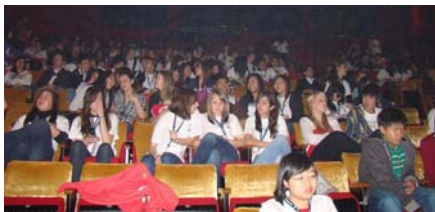
First student leadership conference – Zenith