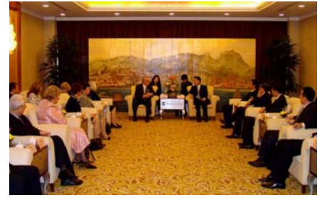
Signing of Qingdao Friendship Agreement, April 21

March 31 – Official tree planting ceremony sponsored by the Japan Consulate and the City of Richmond of Cherry trees and Maple trees on the airport side approach to the #2 Road Bridge to celebrate Japan and Canada's 80 years of relationship.