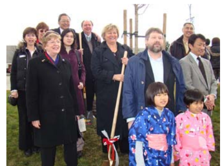
Cherry Tree Planting Ceremony, Japan Canada Relations 80th Anniversary March 31, 2008