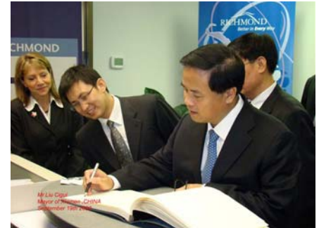
Mayor of Xiamen signs the Richmond Olympic Oval guestbook during his first Official visit