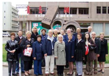
Delegation to Qingdao