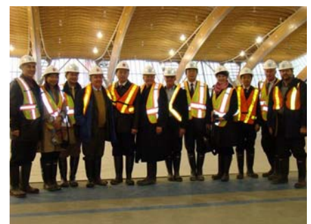
Visit to Richmond Olympic Oval by Qingdao Volunteer Association delegation, November 20, 2008