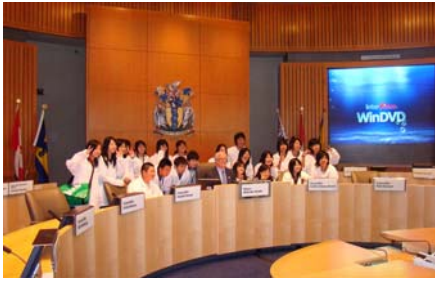
Student visit May 14th from Wakayama