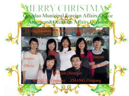
Christmas Card from Qingdao - Qingdao Foreign Affairs, with Christmas greeting, December 2008

The SCC has had a very busy year in 2008 and continues to address some of the most challenging items which include finding the time to manage the program and report out on the wide variety of outcomes that each event or delegation provides. One main outcome that has become evident during the year is that the key role of the Committee must be one of building bridges and links between respective groups and organizations in order that they take over the management of their relationship. The key communication between us and our Asian Cities is with the International Affairs Office or Foreign Affairs Office (FAO). Both sides have recognized over the year that official communications are most effective when maintained through the FAO and the SCC. To support the broad base of activities of the SCC, the Committee has developed a number of sub-committees advising and assisting in the planning and hosting of delegations and activities, as well as encouraging the formation of Friendship Societies (Richmond residents who previously came from the City or are interested and related to each City).