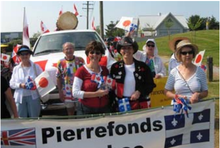
Sister City Committee members with Pierrefonds’ Banner – Salmon Festival parade