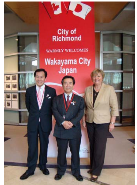
Visit of Wakayama delegation. 35th Anniversary Celebration April 29, 2008