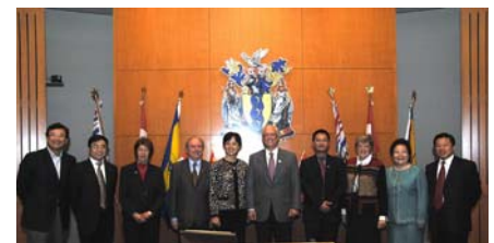
Visit of Yangzhou Goodwill & Economic Delegation, October 22, 2008