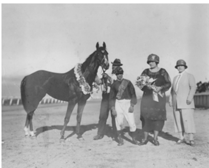
Shadow Spark in the winner's circle following the 1924 BC Derby held at Lansdowne Park in its first year of operation.

City of Richmond Archives Photograph 2015 3 1