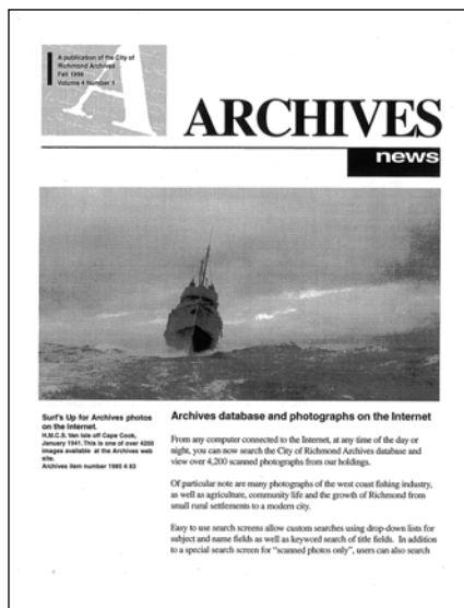
Front page of issue announcing the launch of the Archives’ online photograph database, 1998.