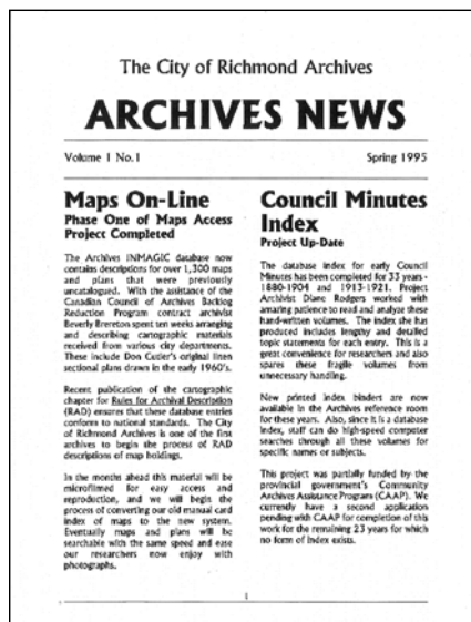
Front page of Volume 1, Number 1 of the Archives News, 1995.