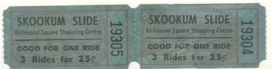
Above: Tickets for the Skookum Slide.

The lease ran out in September 1973 and plans for expansion of the Credit Union and Richmond Square Shopping Centre settled any possibility of extending the slide’s lease. The operation was shut down and the slide removed, leaving some extra parking spaces at the Credit Union and a few nostalgic memories in the minds of those who grew up in Richmond in the early 1970s.