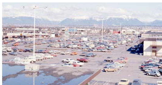
Looking north toward the Skookum Slide, 1973.