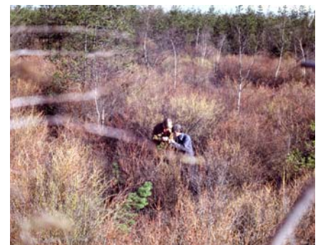
Field researchers in the bog at Richmond Nature Park, 1972.