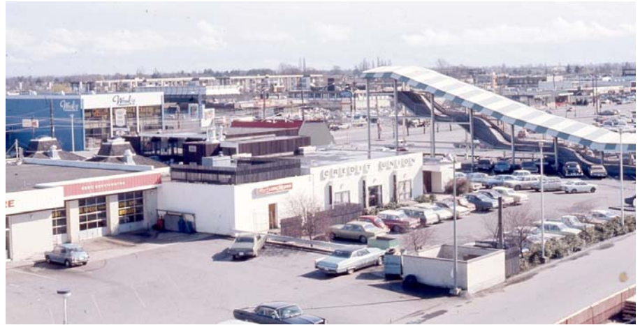
Looking southeast toward No. 3 Road, with Skookum Slide on the right, 1973.

The project received approval from the Planning Department and the company sub-leased parts of lots from the Richmond Savings Credit Union and the Dairy Queen at Richmond Square (now Richmond Centre Mall). Construction of the slide was underway by January 1969