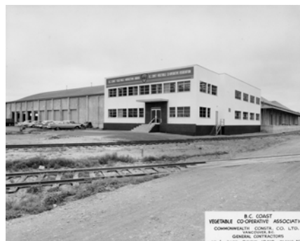
The BC Coast Vegetable Co-operative Association's Richmond plant at the time of its official opening in 1959.

City of Richmond Archives Photograph 2015 3 1