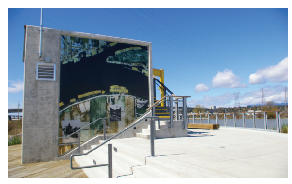
New No. 4 Road Drainage Pump Station.

As the public art landscape of Richmond continues to grow, the resources at the Archives have been increasingly used for inspiration by a number of artists. One recent example is the art installation at the No. 4 Road Drainage Pump Station, which used a 1954 aerial photograph and images derived from other historical photographs in the Archives' holdings. The City of Richmond was recently awarded the 2012 ACECBC Award of Excellence for its design of the pump station.