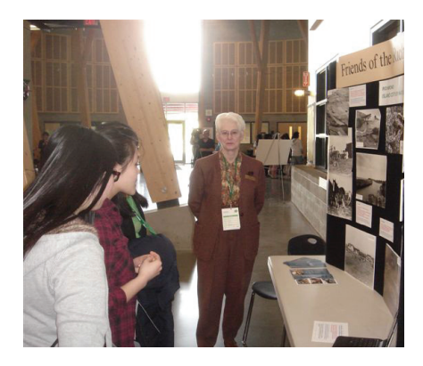
"Sustainability" exhibit at Earth Day Summit (London-Steveston High School)