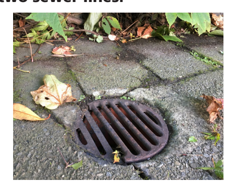
Storm drainage sewer