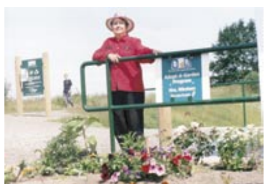
Adopt-a-Garden on West Dyke Trail