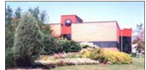
Pierrefonds City Hall

For more information please visit the web site www.ville.pierrefonds.qc.ca .