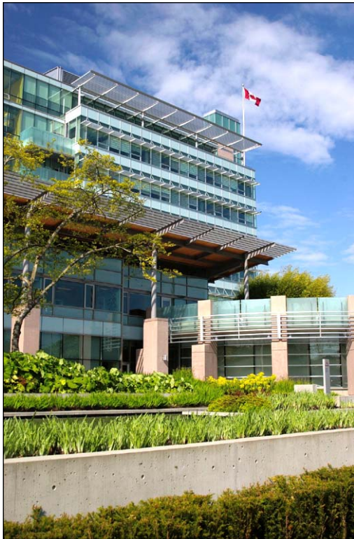
Richmond City Hall

The City of Richmond (population 166,500) has established important ties and relationships with the following cities as part of the Sister City Program: