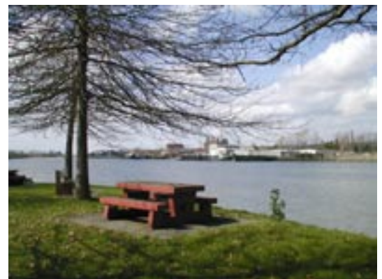
Mc Donald Beach