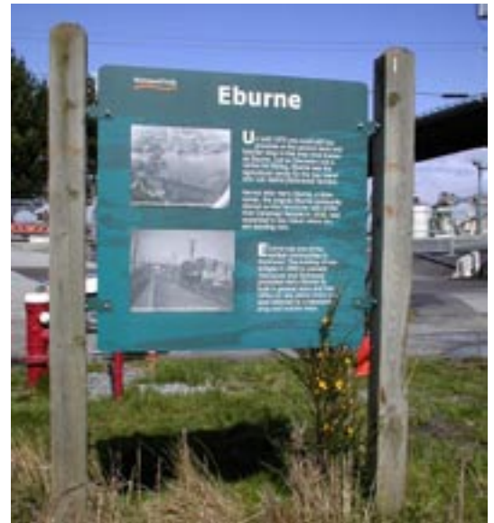
Sea Island heritage