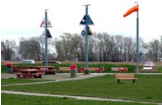
Flight Path Park (Russ Baker Way)