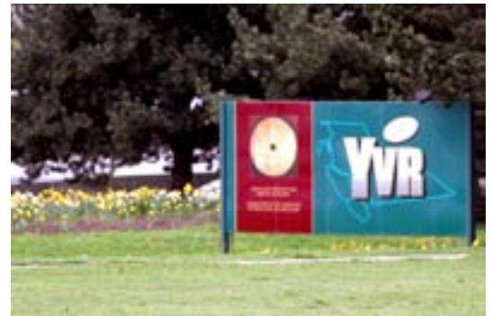
Vancouver International Airport

The majority of Sea Island is owned by the Federal Government and administered through Vancouver International Airport Authority who have developed a Parks and Recreation Plan for the Island. A number of cycling paths have recently been constructed that link with the new Moray Channel Bridges. The Authority is in the process of developing a new Land Use Plan. The North Fraser Port Authority developed a Port North Fraser Land Use Plan in 2000 that outlines policies and land use designations along the North and Middle Arm of the Fraser River. Environment Canada, through the Canadian Wildlife Services (CWS), administers the Sea Island Conservation Area (345 acres) at the north end of the Island. The GVRD administers Iona Island Park (319.8 acres) and is considering expanding its park holdings in the future. South of Sea Island, in the mouth of the Middle Arm, is a 72 acre island that is owned by the Nature Conservancy of Canada and protected as a nature reserve with limited access for research purposes.