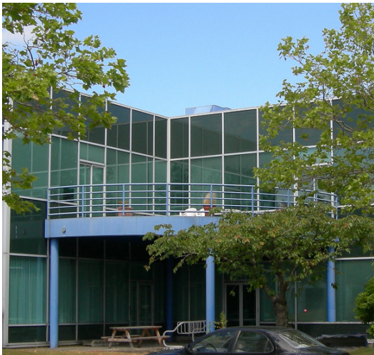
Balconies – Child of the Fraser