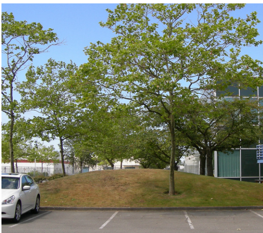
Grassy Mound – Salmon