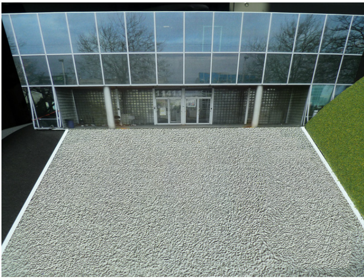
Entrance Plaza – Mosaic Design