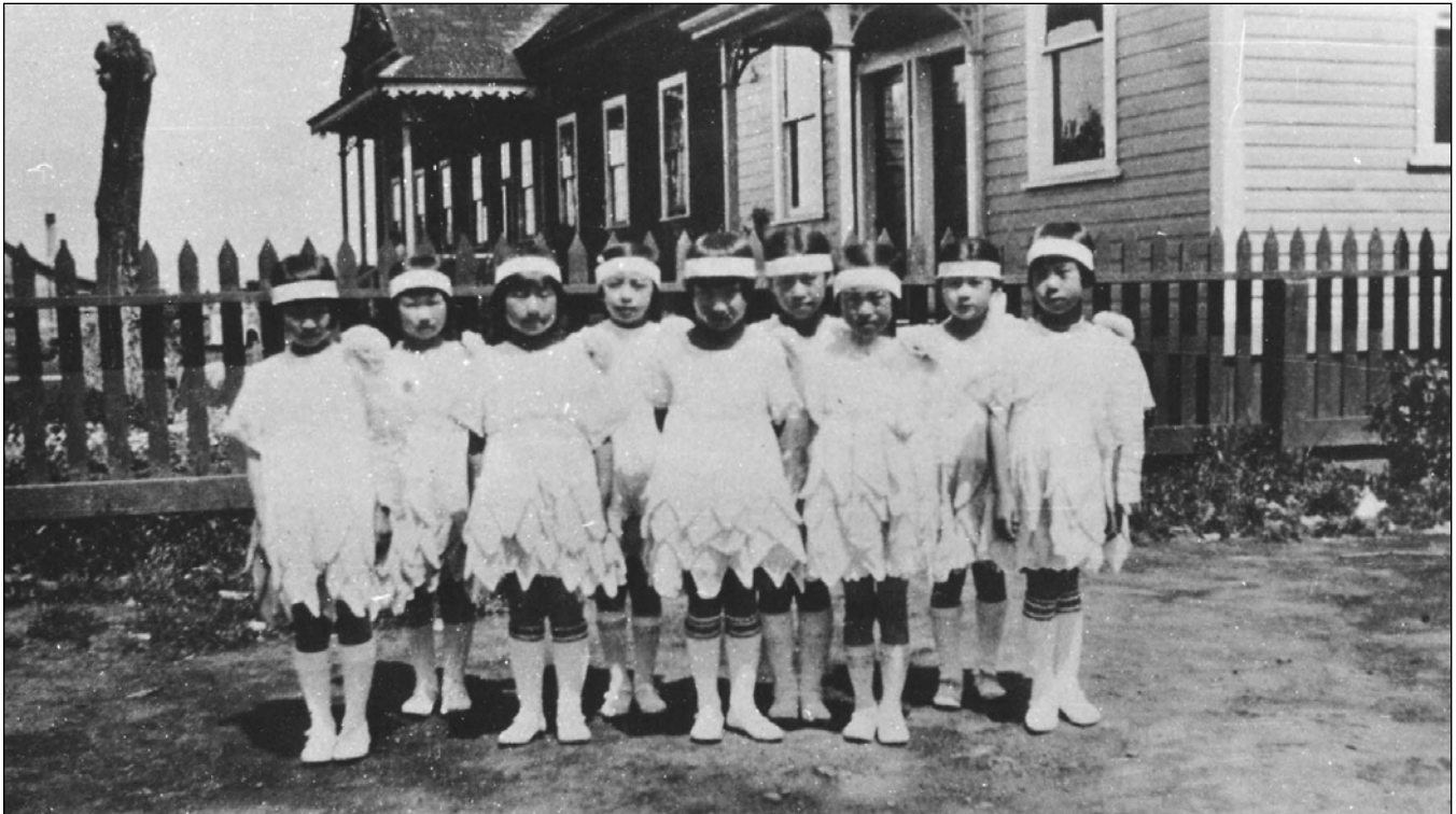
Photograph of students in traditional May Day dress standing outside the Steveston Japanese School, May Day, 1930. The Steveston Fishermen's Hospital is the building to the far left, and the Doctor's and Hospital Offices (in the original location, now 4091 Chatham Street) is the building to the right.