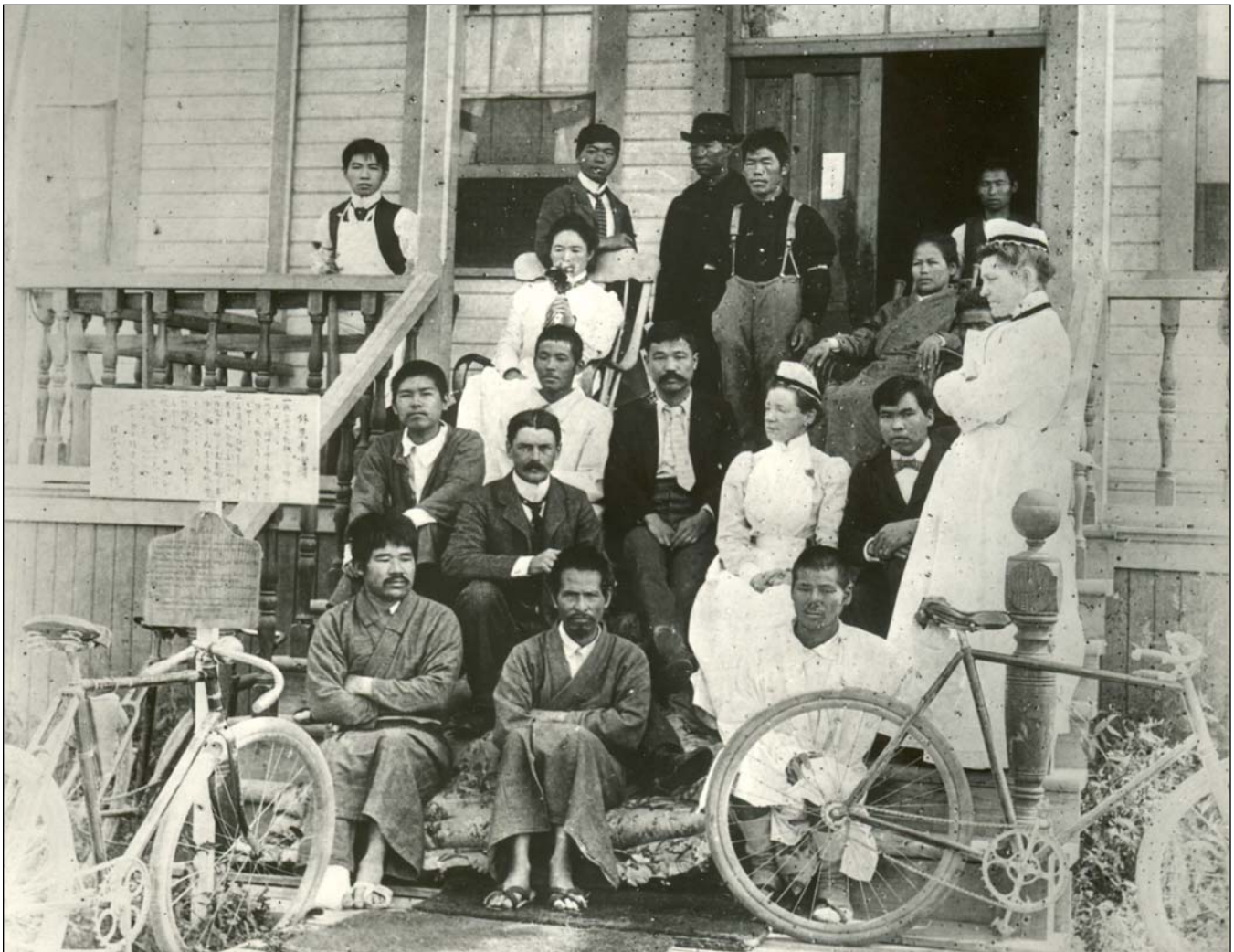
Photograph of a group of nurses and patients on the front steps of the Japanese Hospital in Steveston circa 1900.