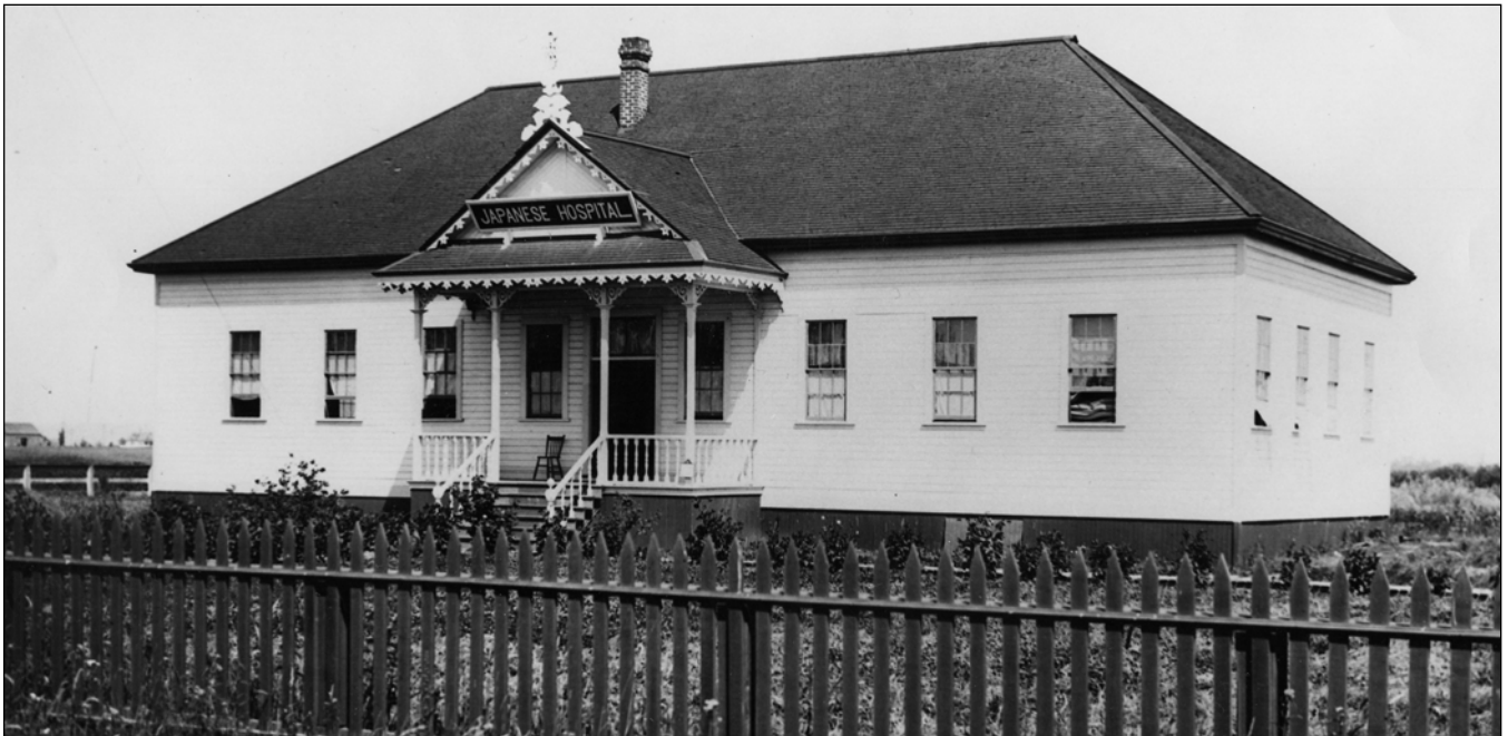
Photograph of the Japanese Hospital in Steveston circa 1920, showing some of the gardens in front of building.

Please tell us where on the Survey Questionnaire.