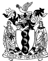
City of Richmond