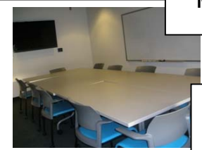
Meeting Room 1