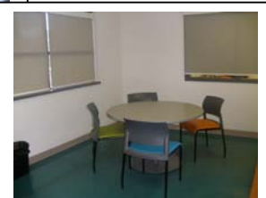
Meeting Room 2