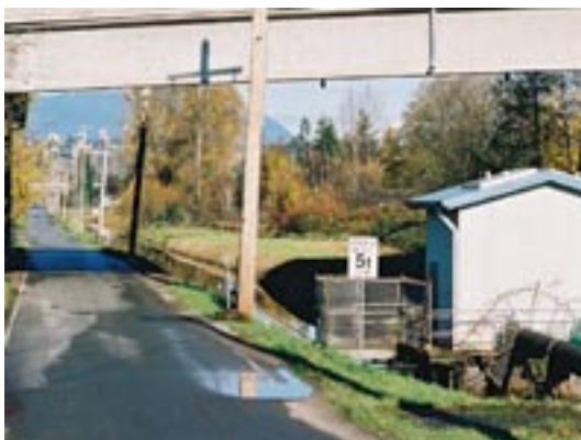
Boundary Road / New Westminster