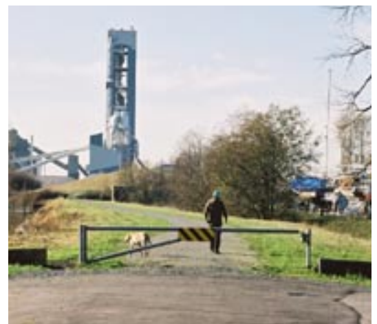
Dyke east of No. 9 Road Lafarge Concrete in plant in the background