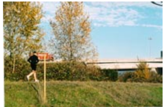
Dyke Trail to Boundary Road