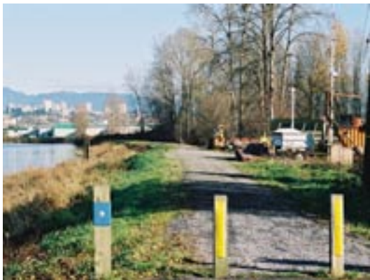
Dyke ends at the Tree Island Ltd. site