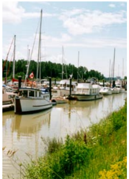
Shelter Island marina