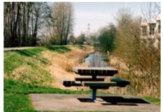
Pocket Park Fraserwood Industrial Park